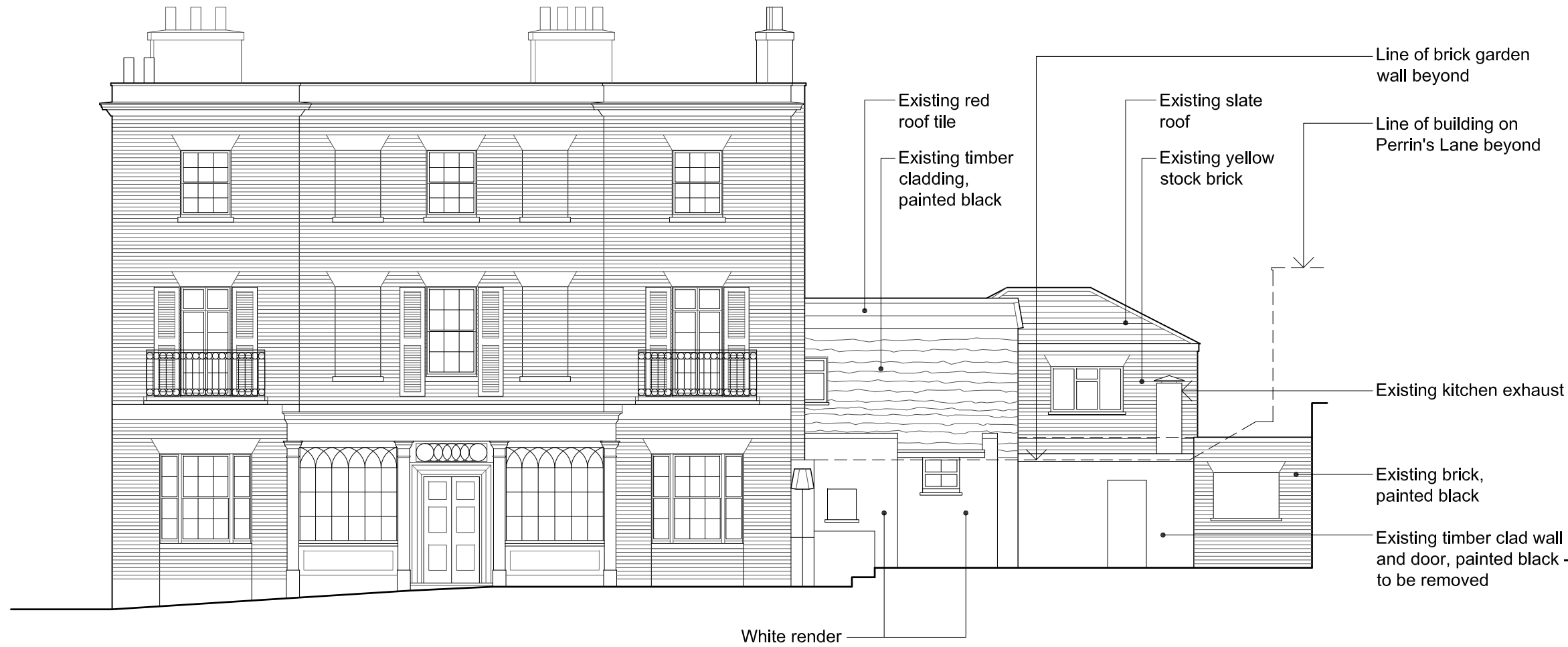
1 North Elevation - Existing Scale 1:100 5m

Note: Area of proposed alterations do not affect street elevations along Hampstead High Street and Perrin's Lane as seen from street level outside the garden wall. Please refer to Historic Structure Drawings on H-001 for reference.