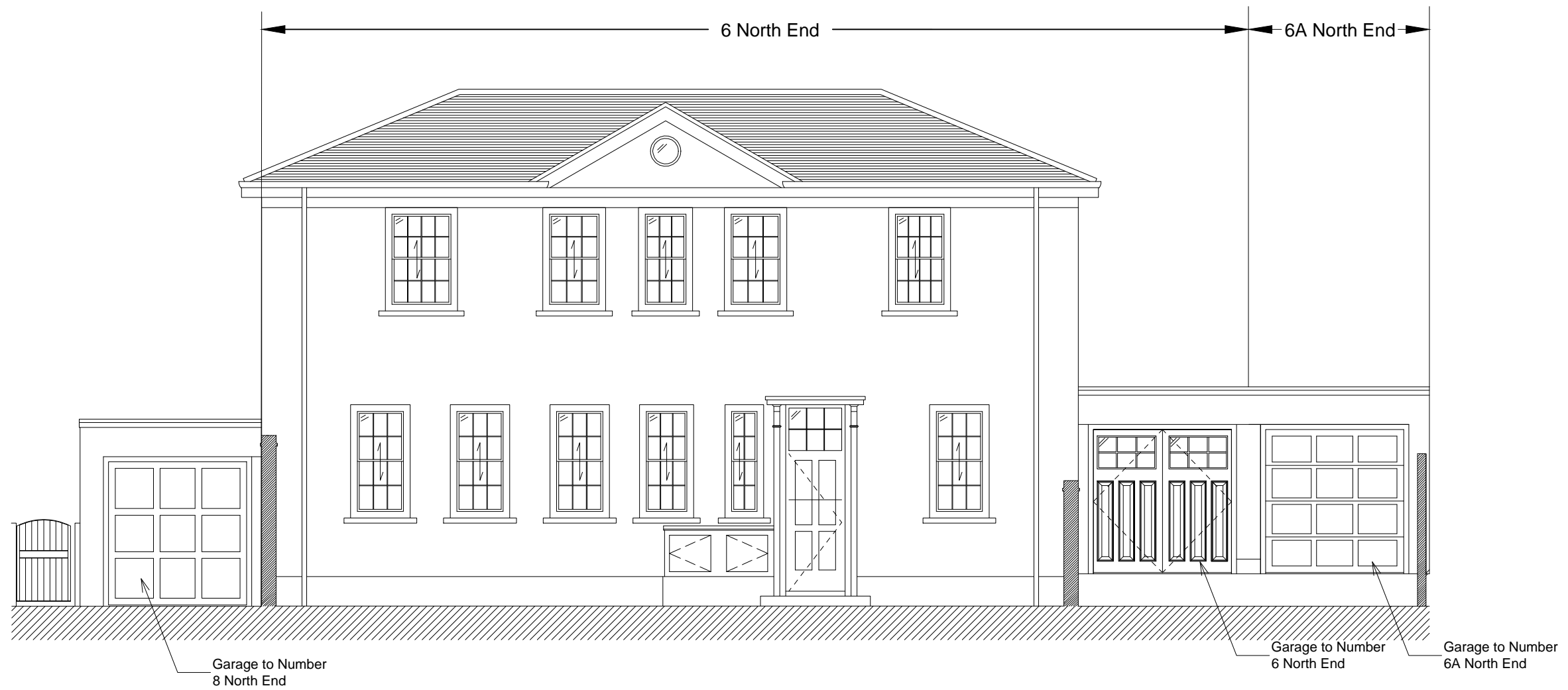
D Existing South Elevation Scale 1:75