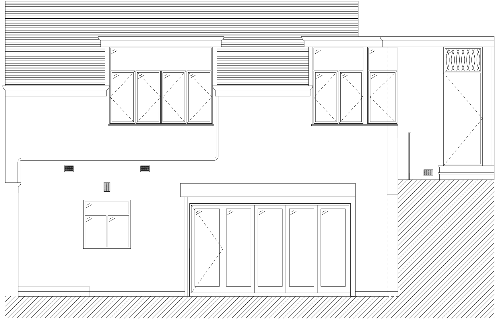
B Existing West Elevation