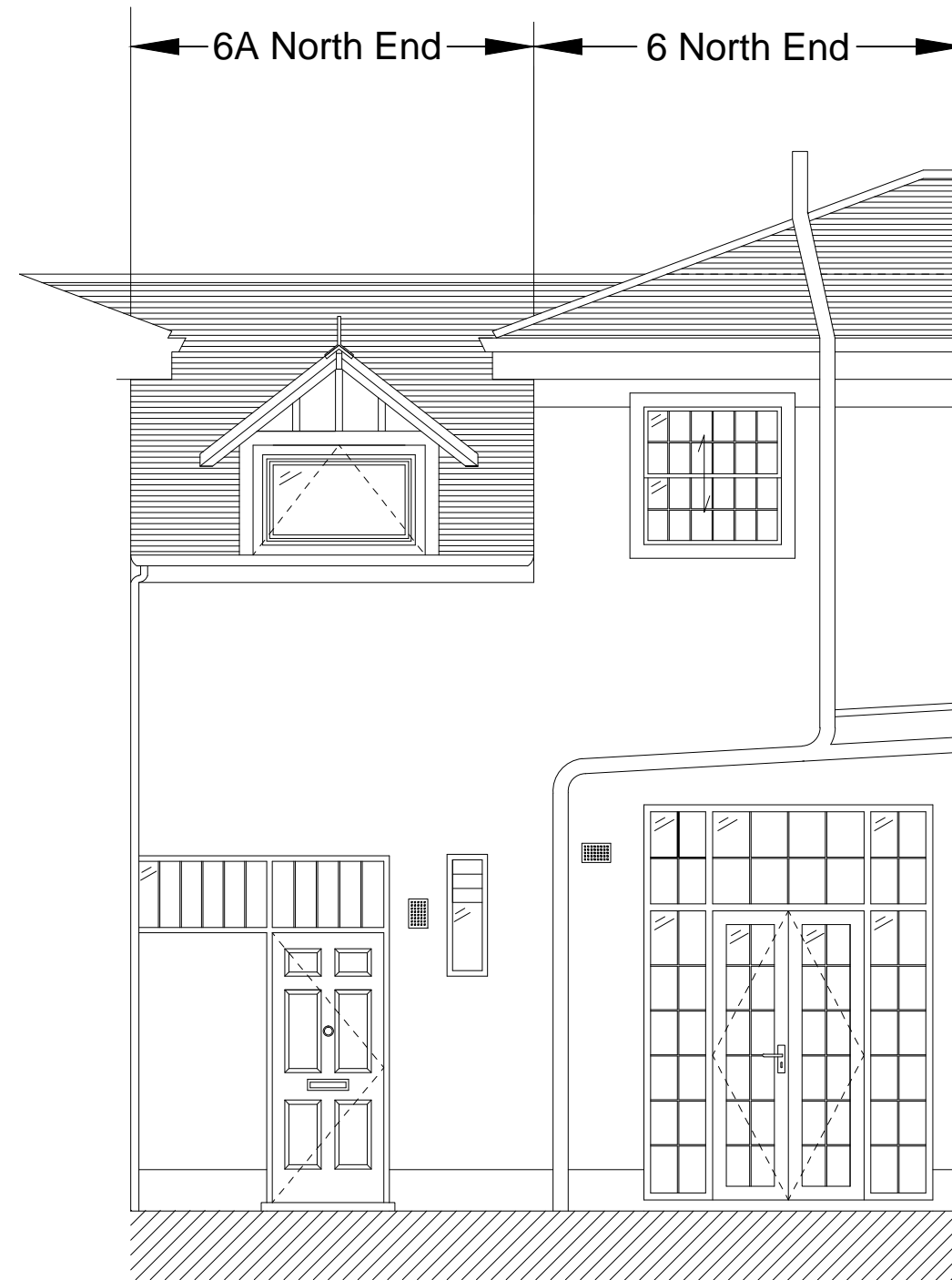
A Existing East Elevation Scale 1:50