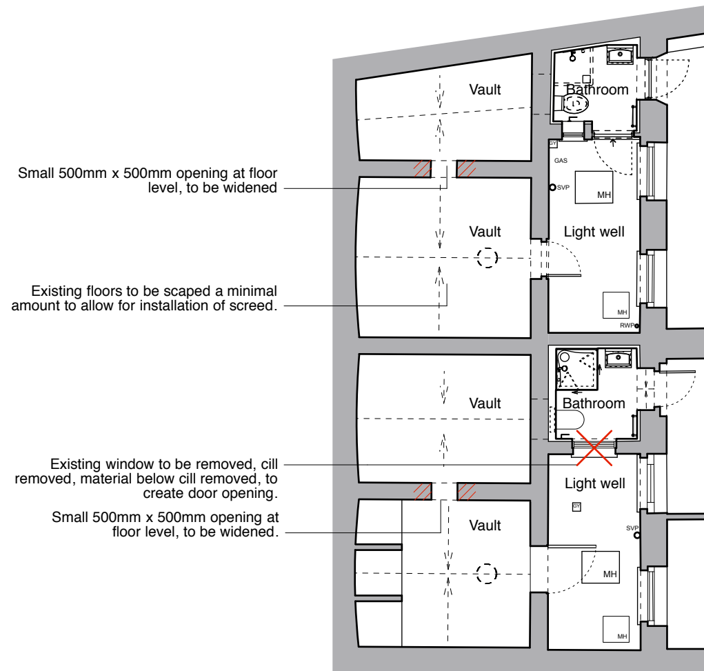
A Existing Vaults Plan - no. 32 - 33