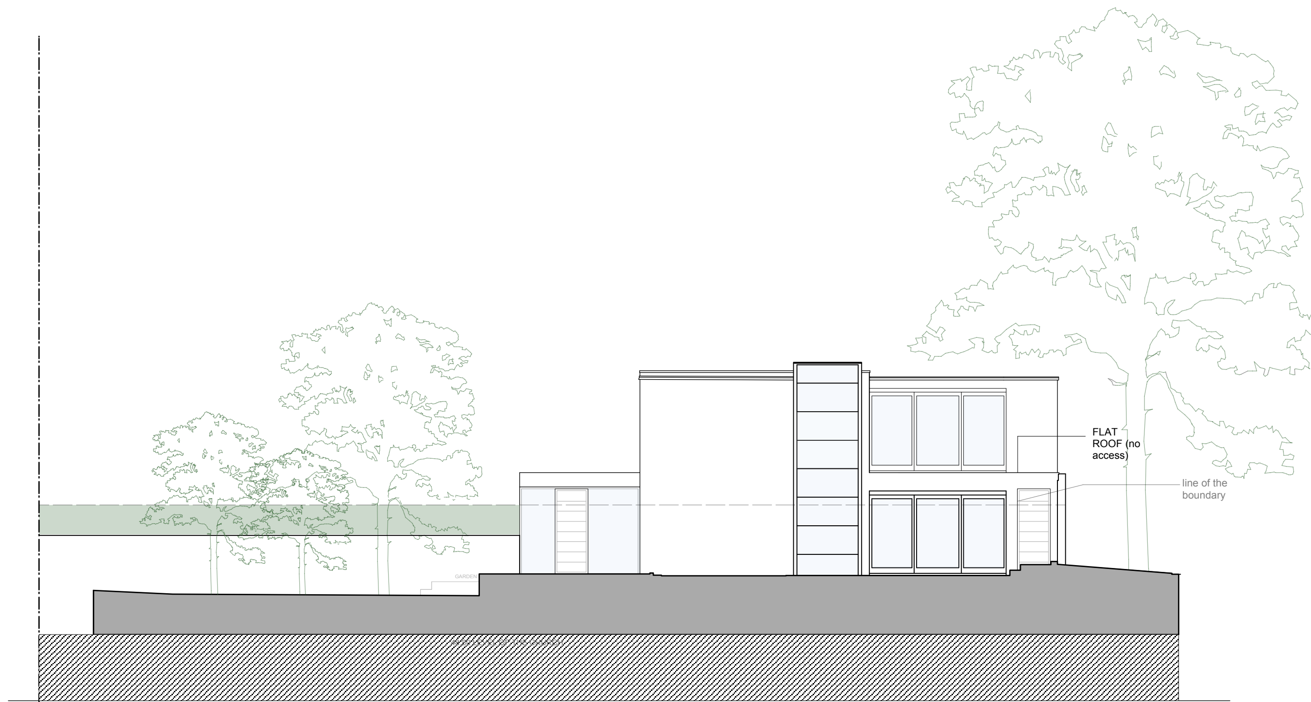
Tasker Road Elevation