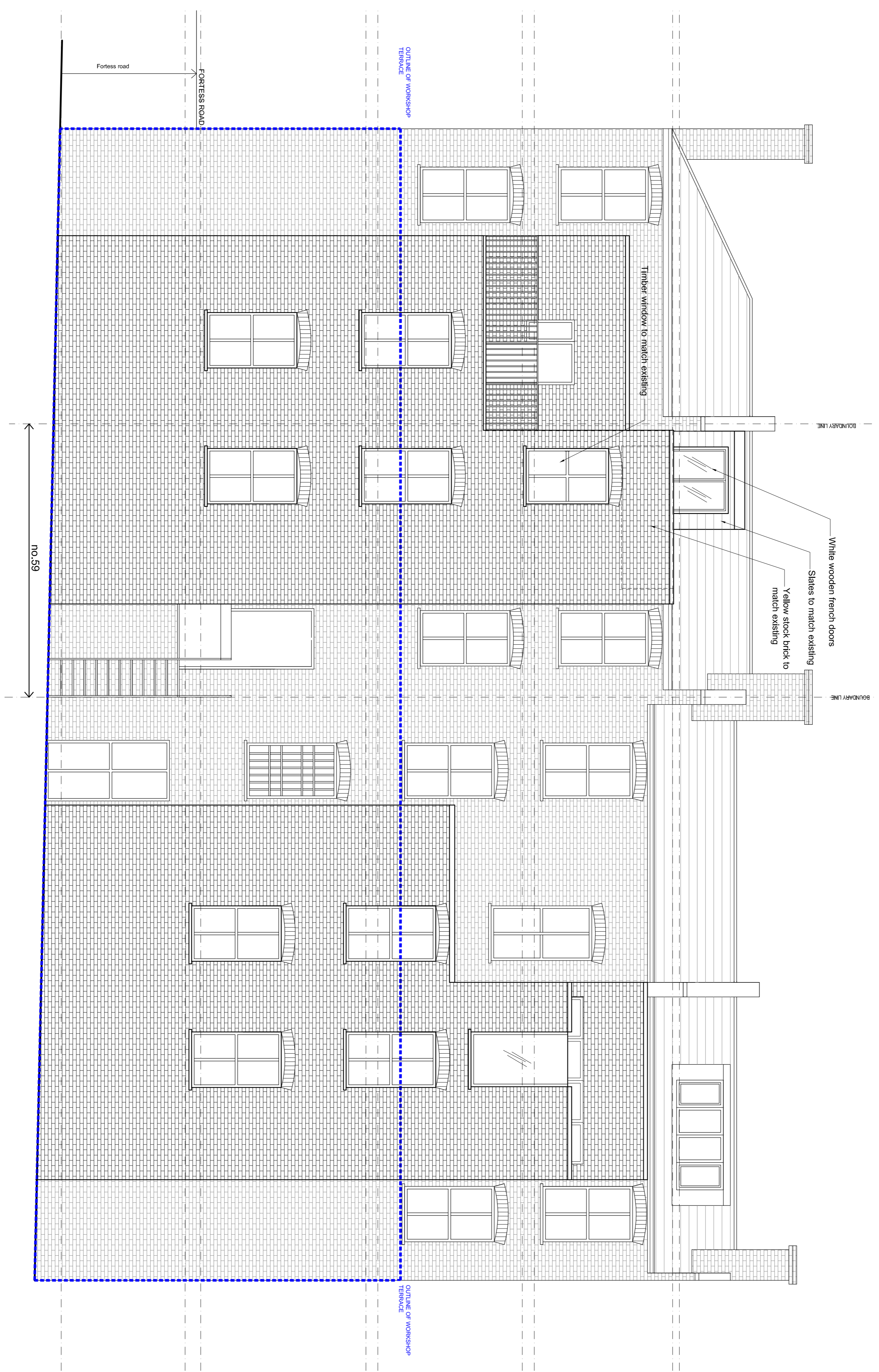
02: PROPOSED REAR ELEVATION SCALE 1:50