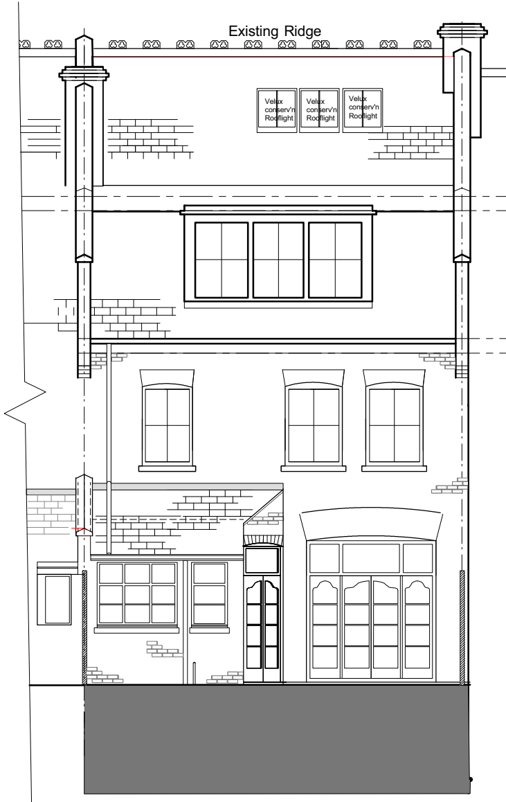
APPROVED BACK ELEVATION of No. 6