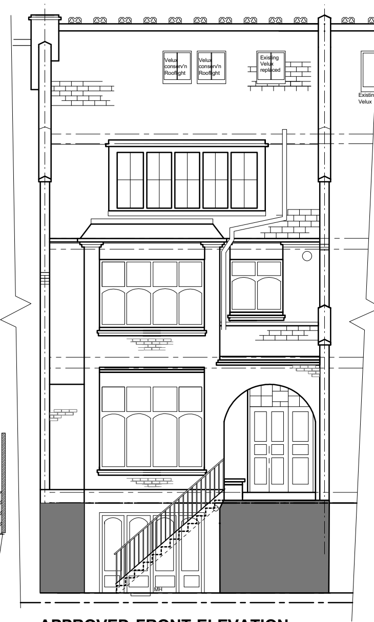
APPROVED FRONT ELEVATION