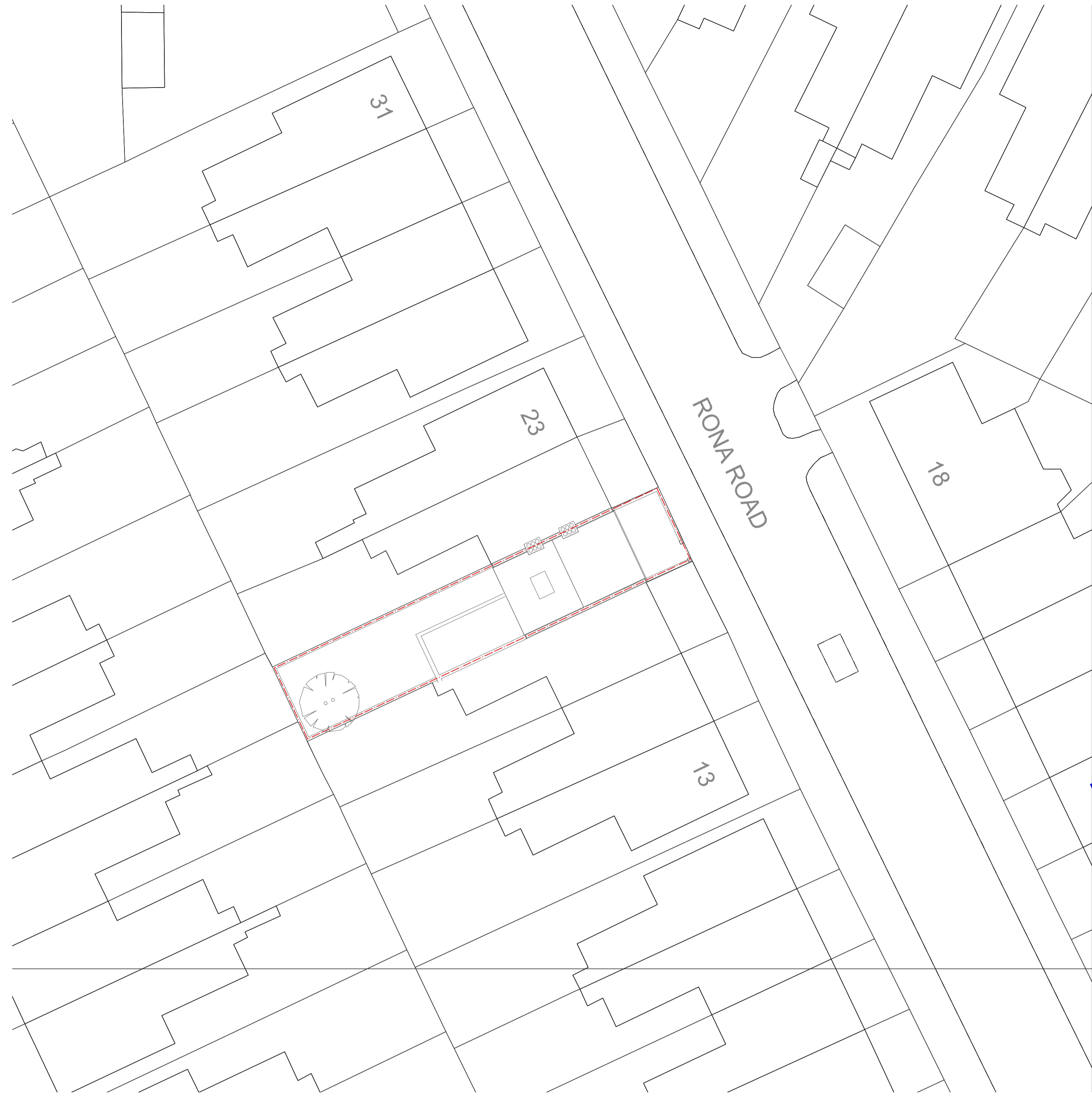
1 Existing Site Plan 1:200

Copyright in the design and this drawing is the property of 51% Studios Limited. Reproduction in whole or in part is forbidden without written permission of 51% Studios Limited. All Dimensions are to be checked on site before any work proceeds. Do not scale this drawing but use only figured dimensions. Any errors or omissions are to be reported to 51%. The contractor shall submit full size drawings and specifications to 51% for approval, without which, manufacture shall not commence. This drawing is to be read in conjunction with all the relevant consultants' and / or specialists' drawings/documents, and any discrepancies or variations are to be notified to 51% before work commences. For further information please see other drawings and documents enclosed with this drawing. For information on structure use engineer's drawings. For further information on services use engineer's and/or contractor's drawings.