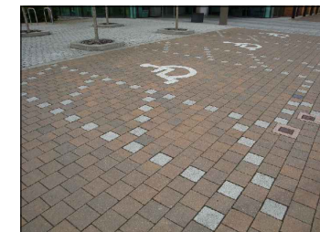
EXAMPLE OF PARKING BAY DEMARICATION