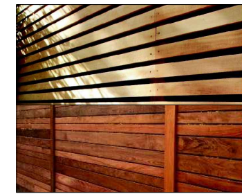
EXAMPLE OF HARDWOOD TIMBER PRIVACY SCREEN