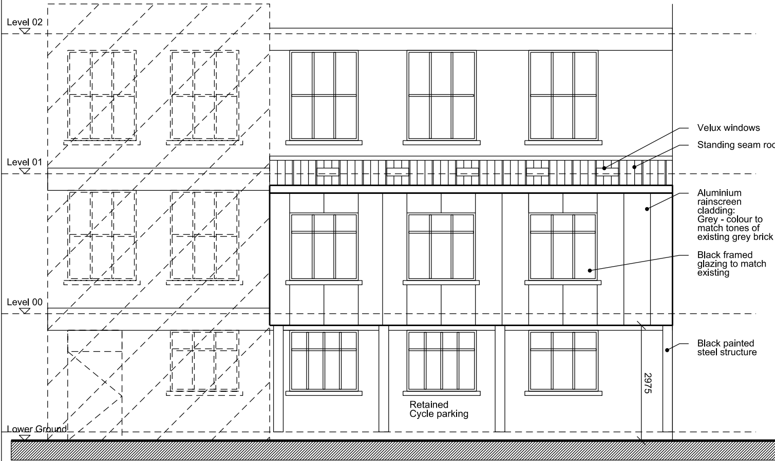
External Fire Escape Stairs Proposed Extension