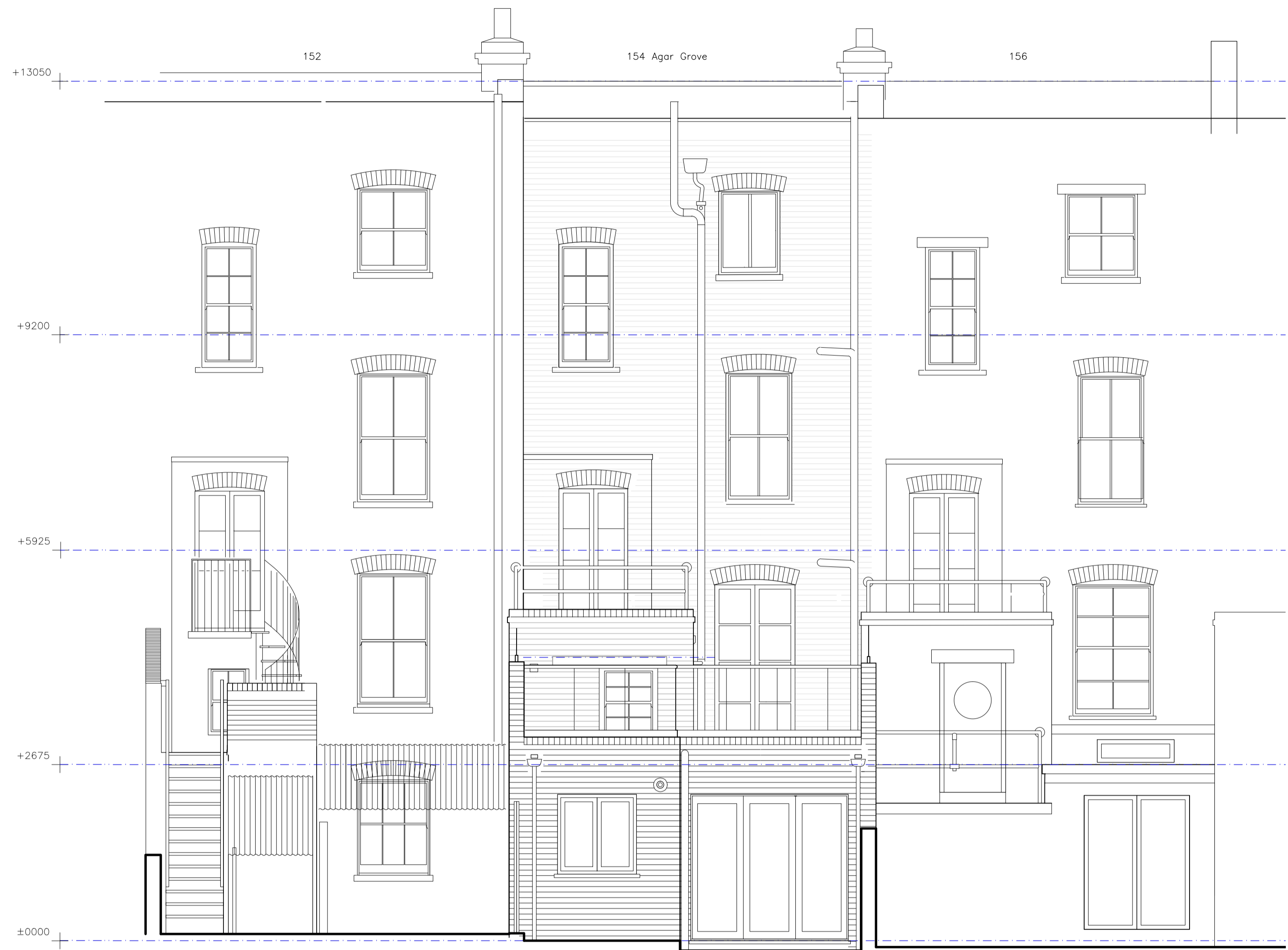
01 South Elevation PROPOSED 1:50