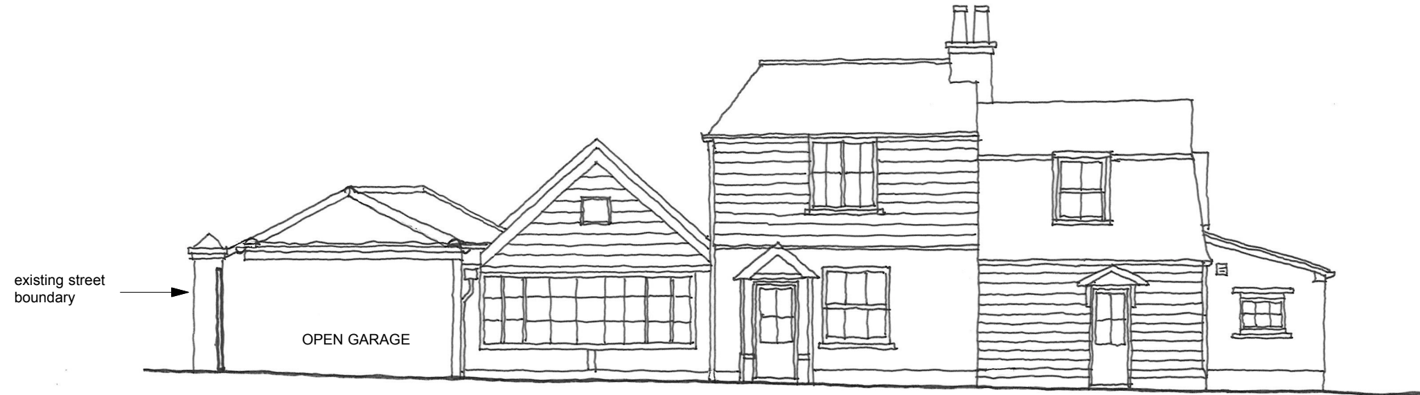
Existing South Garden Elevation