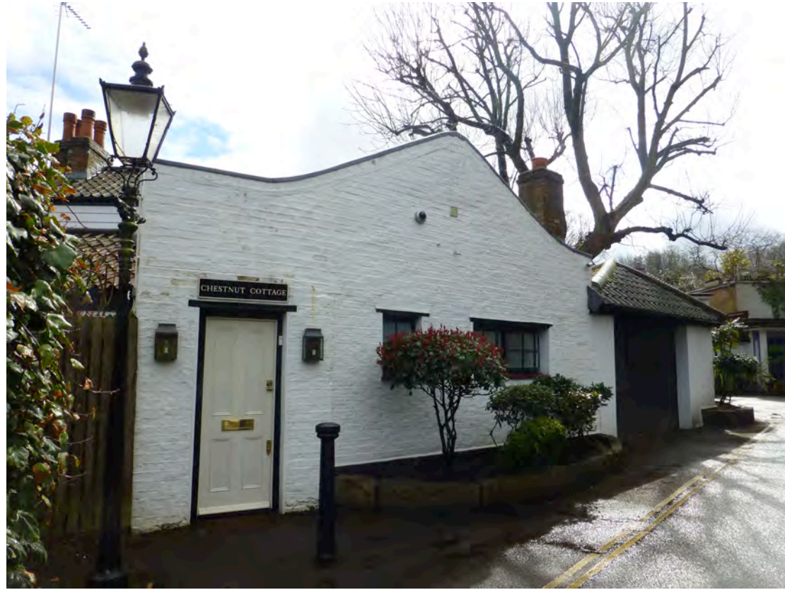
North street elevation