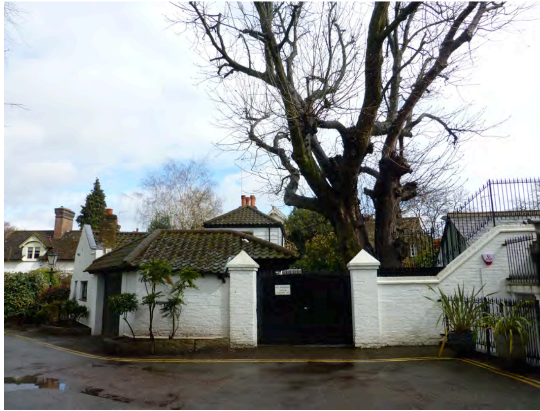
West street elevation