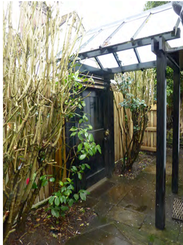
Non-original entrance gate and porch off footpath, to be removed