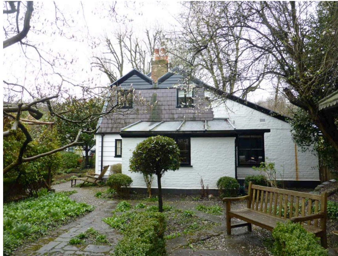
East elevation of cottage