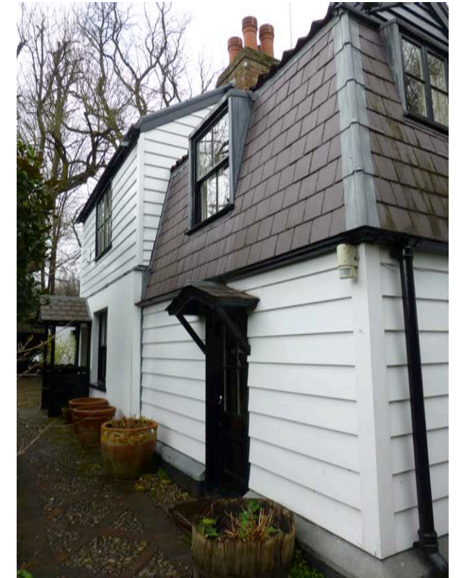
South garden elevation