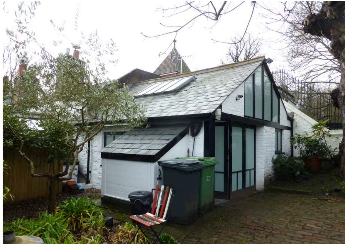
East elevation of separate garage/utility building