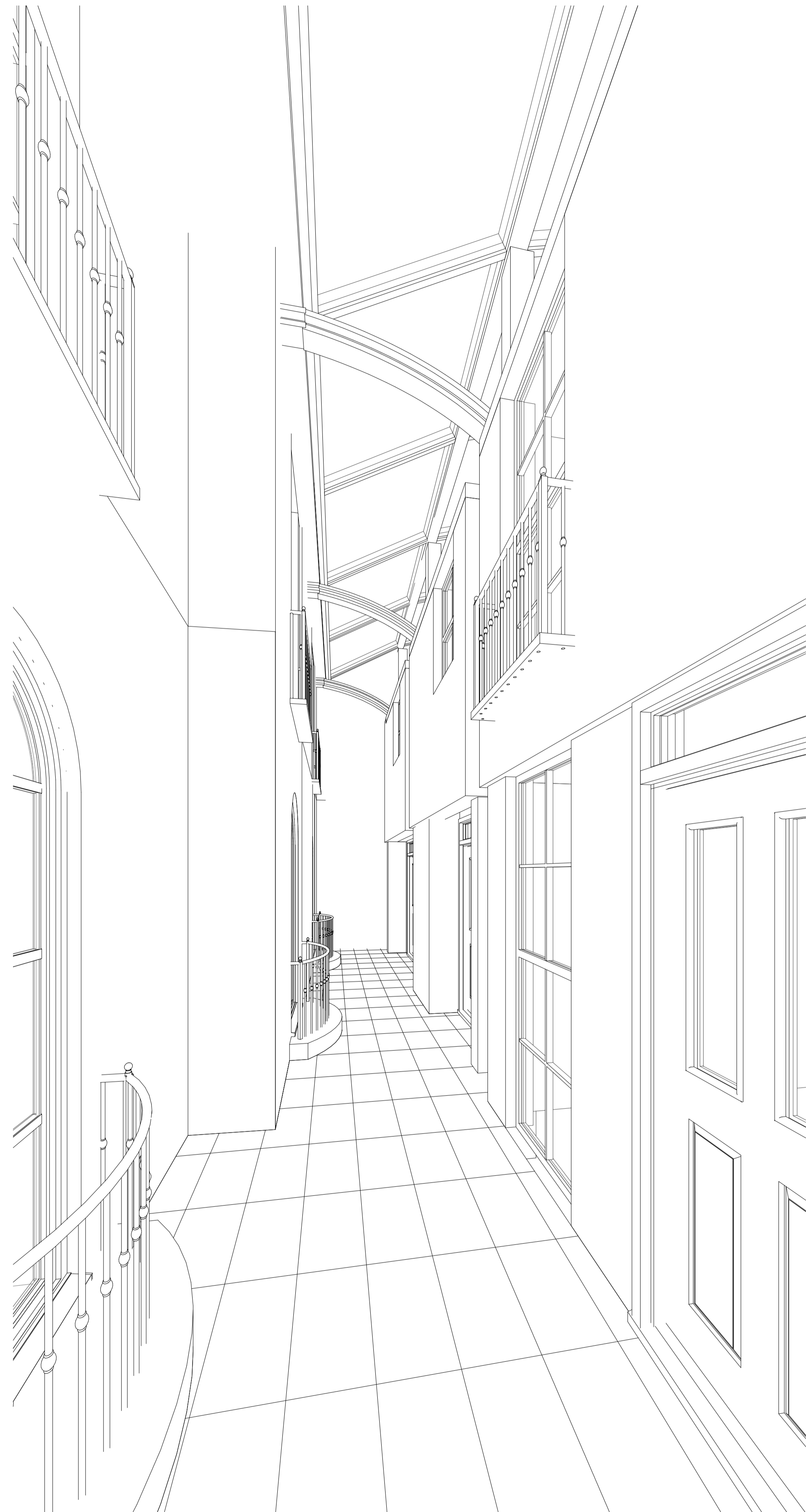
1 3D View 2