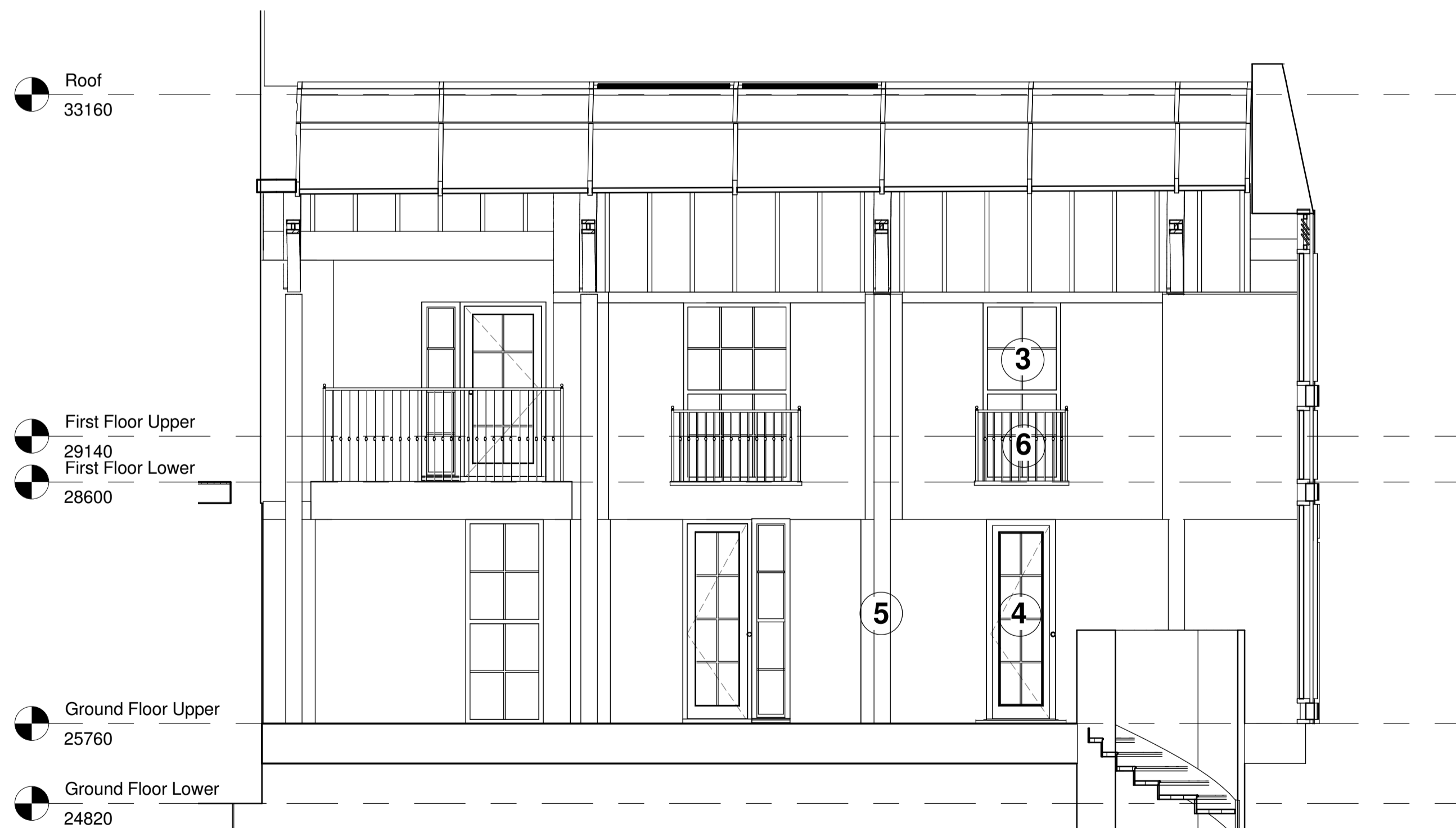
3 Proposed Elevation 2 1 : 50