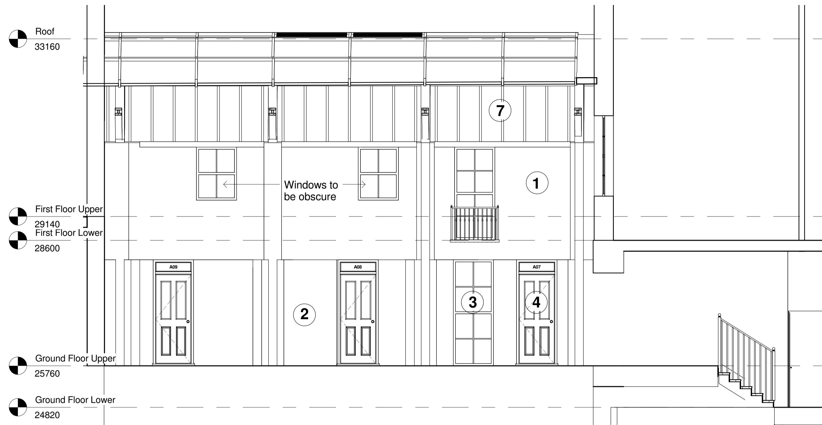
1 Proposed Elevation 1 1 : 50