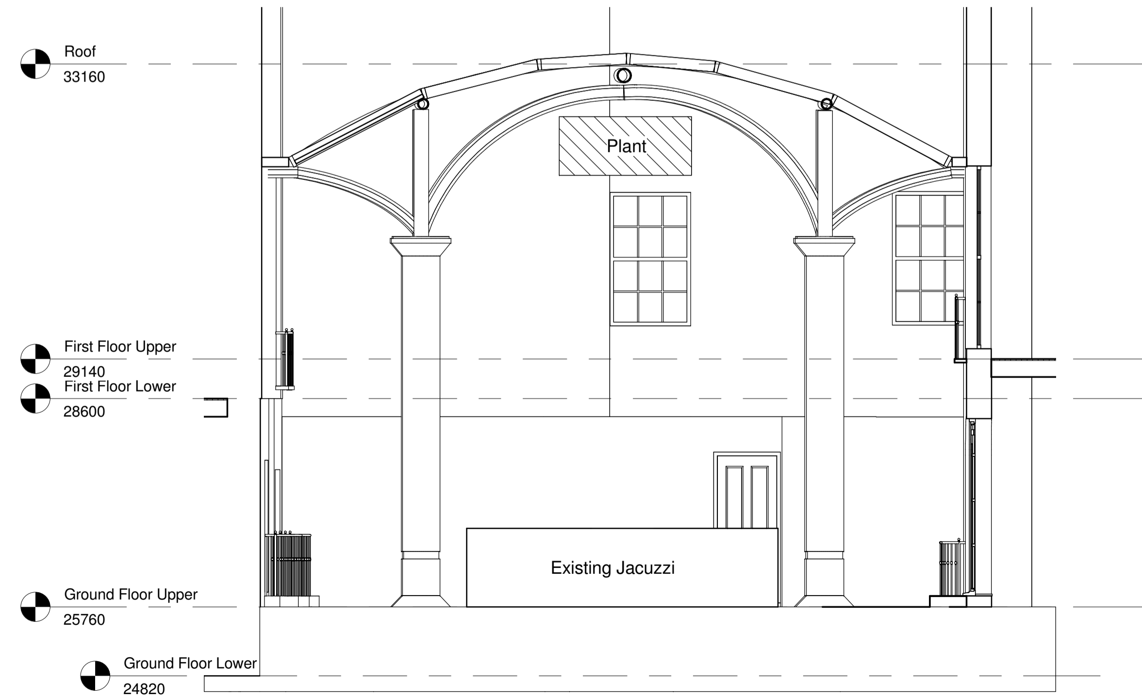
4 Existing Elevation 4 1 : 50