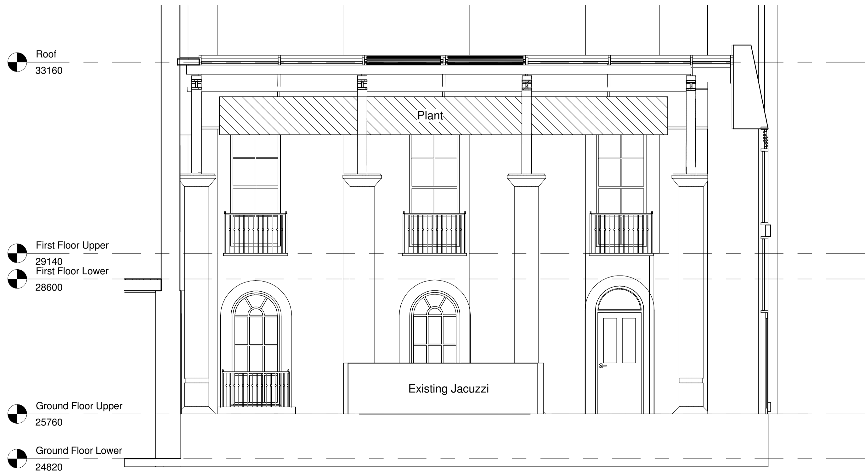
3 & 5 Existing Elevation 3 1 : 50