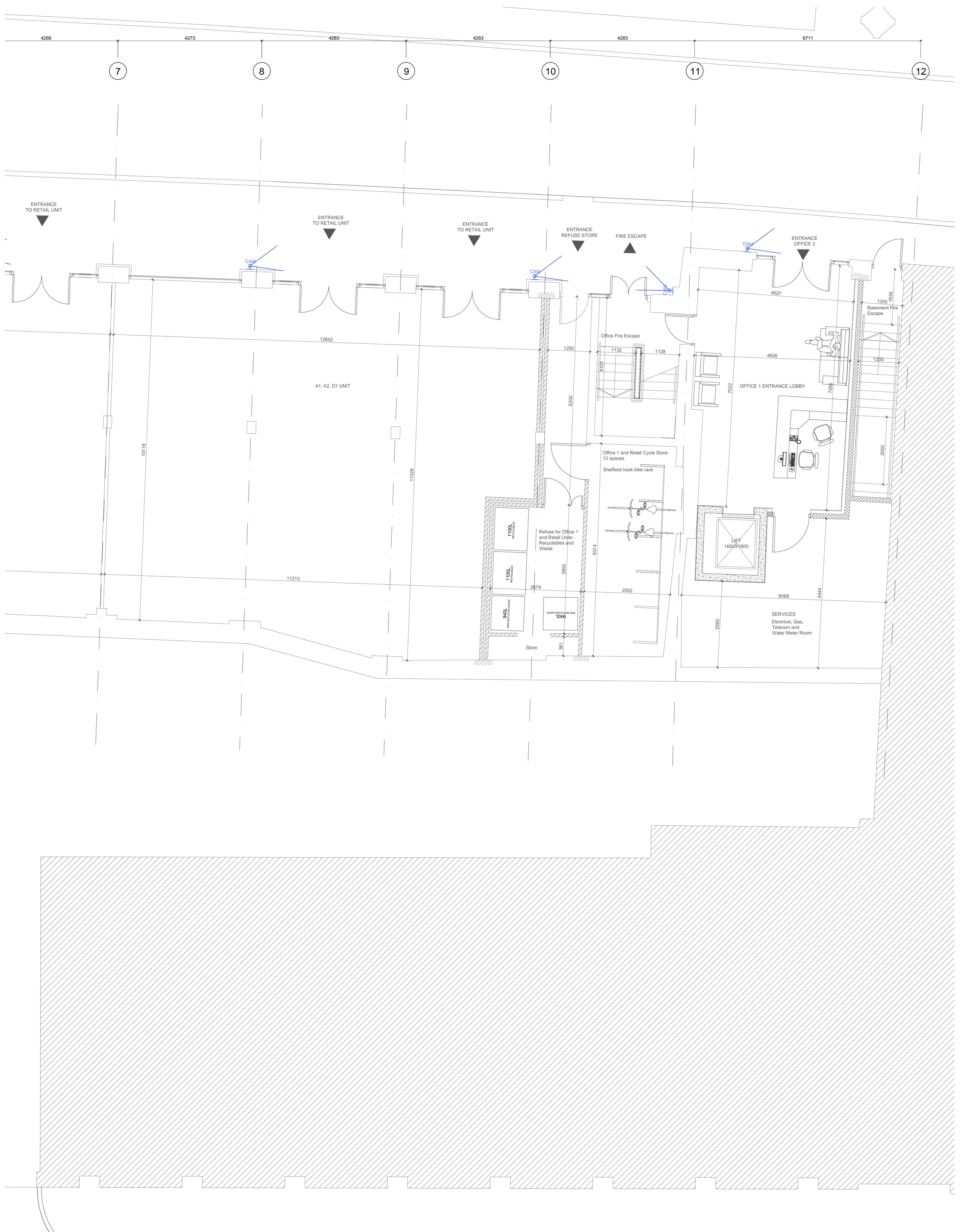
GROUND FLOOR PLAN 1:50 EXTERNAL CAMERA LAYOUT