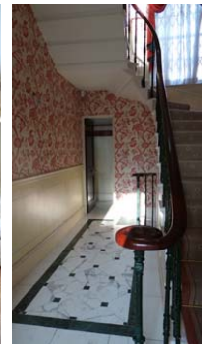
The building interior has been significantly altered over and non sympathetic fixtures and features were mixed with remaining original elements.

The interior works will include renewal of interior fixtures and fittings, including removal of nonoriginal floor and wall finishes and decorative features. Reinstatement of a more style and age appropriate interiors scheme will take a place and make the house interior appreciative the building's heritage and historical and architectural merits.