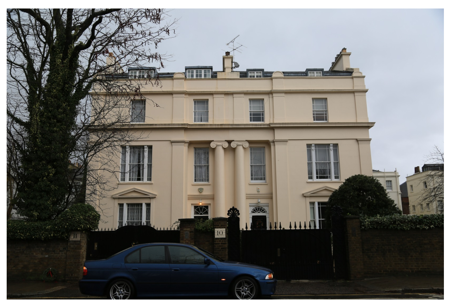
Street View - Front elevation

The proposals put forward are for a single storey side extension at the lower ground level, a single storey basement excavation and internal alterations of the existing Grade II Listed building.