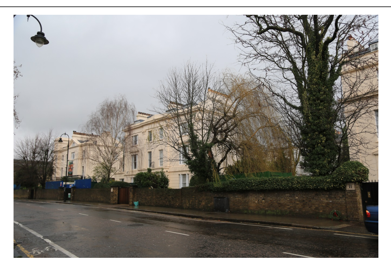
View of the row of villas

The front and side elevations of the building mostly retain their original form. The rear of the property has been extended and altered in the later 20th century, possibly as a result of bomb damage sustained during the Second World War and subsequent external alterations undertaken in the late 20th century . These later alterations are evidenced by later brickwork and the insertion of concrete window lintels. For further details please refer to Heritage Statement submitted in support of this application.