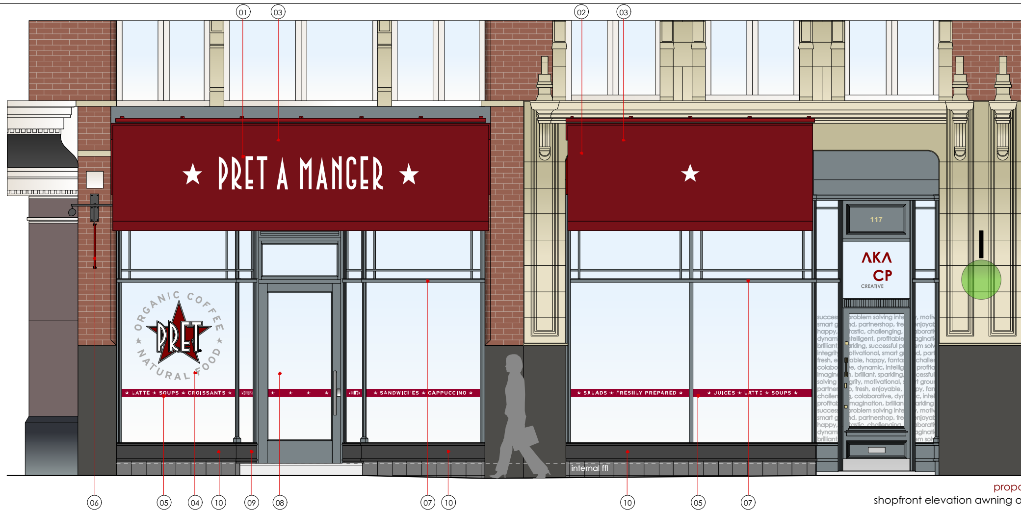
proposed shopfront elevation awning open 1:50