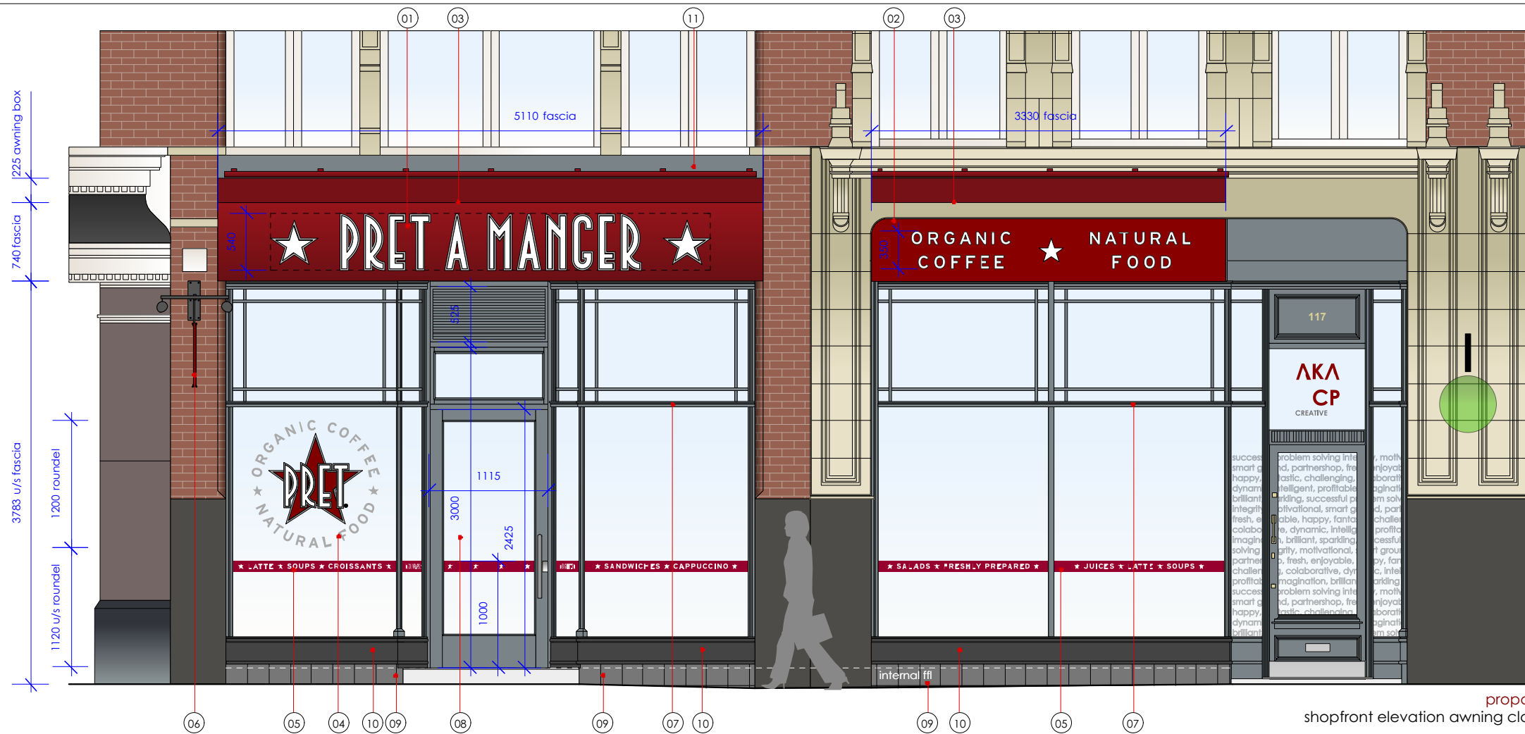
proposed shopfront elevation awning closed 1:50