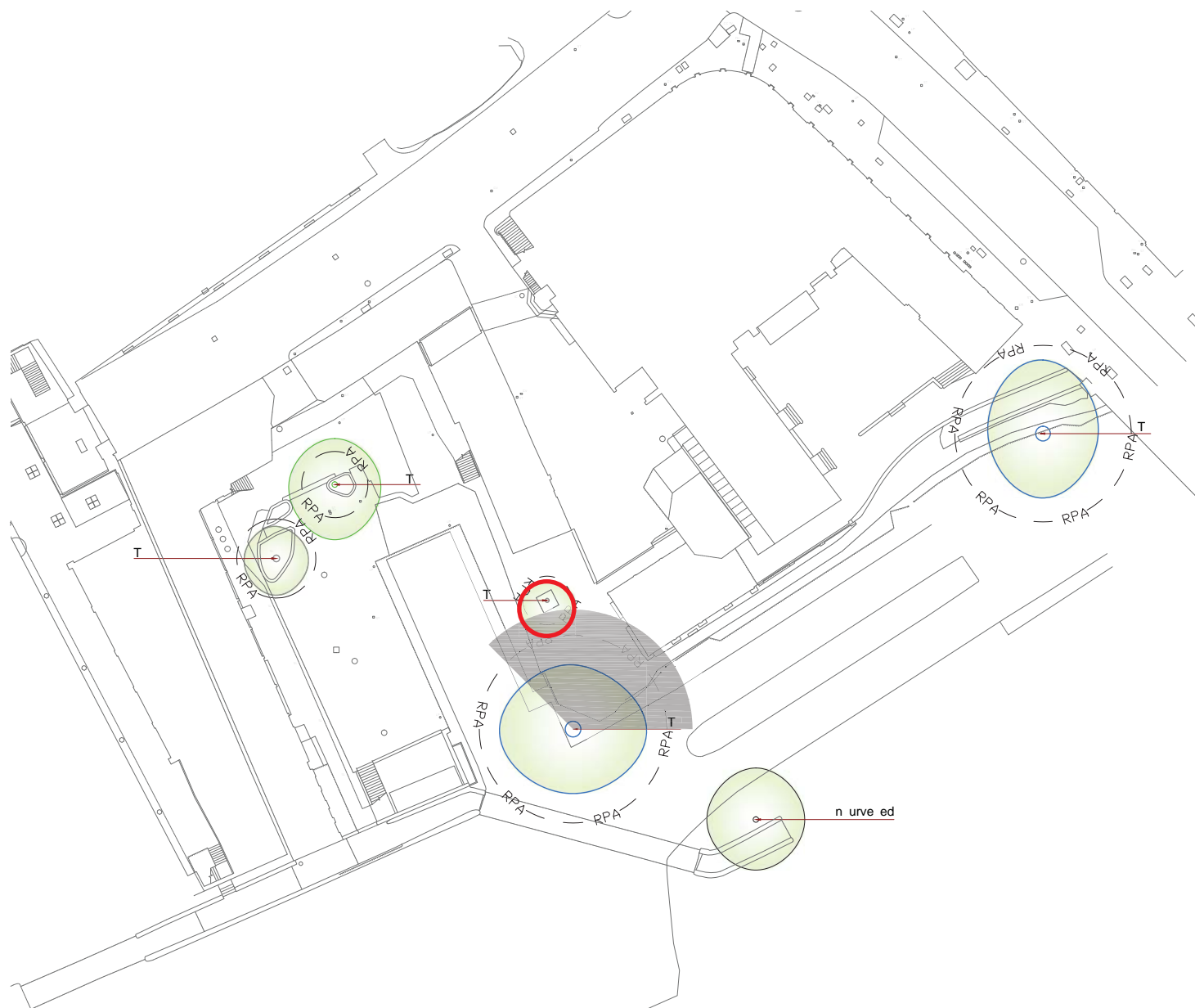
Existing plan show tree planting

For further details, please refer to the Arboricultural Report prepared by AECOM Environment on behalf of the Applicant.