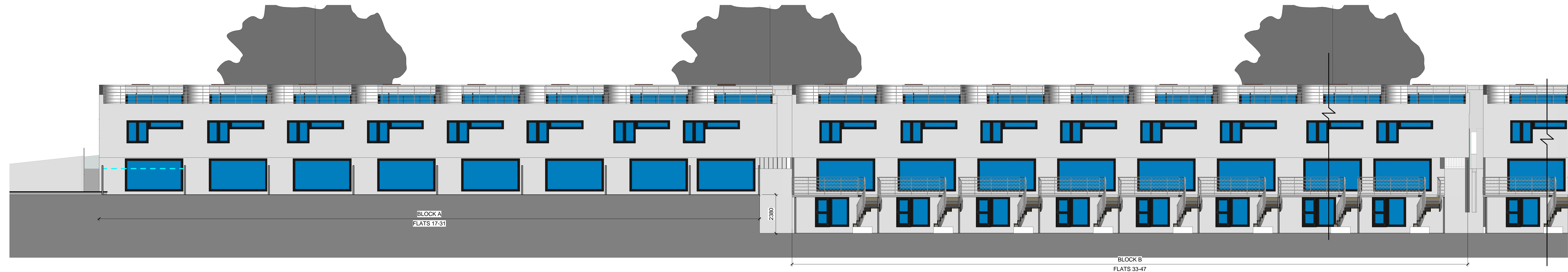
3 Existing Elevation - Rear 1 1 : 100