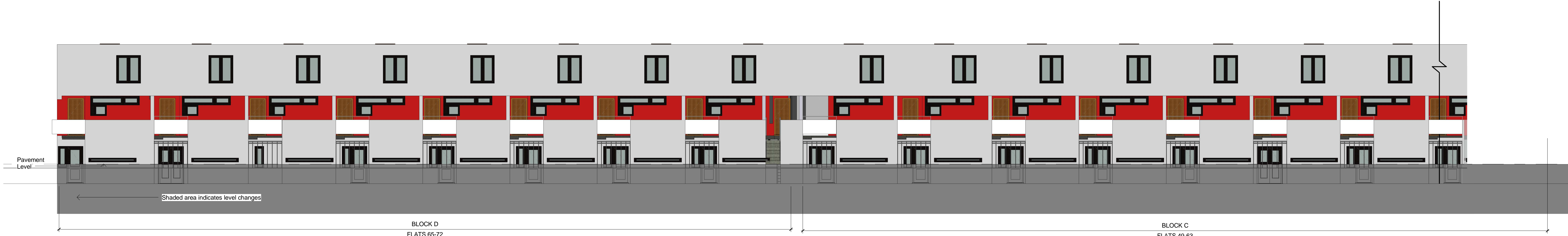
1 Existing Elevation - Front 1 1 : 100