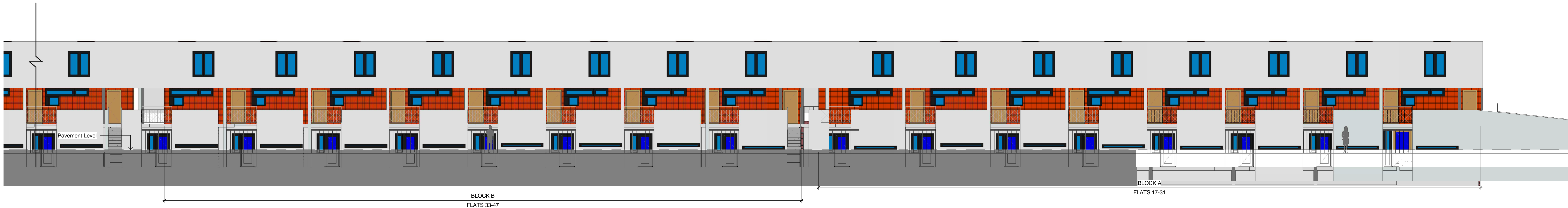
2 Existing Elevation - Front 2 1 : 100