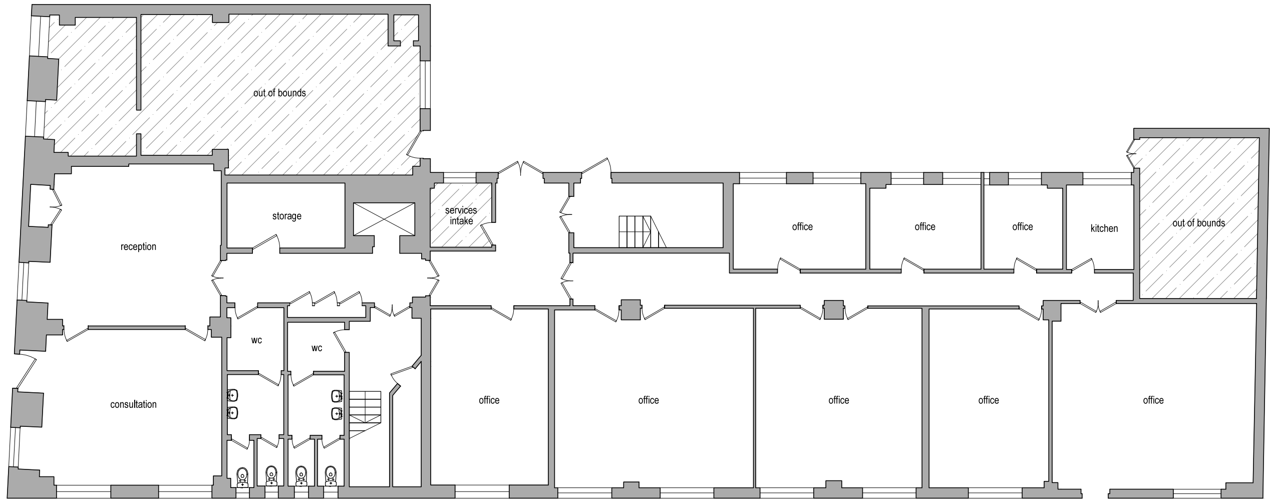
Lower Ground Floor Plan