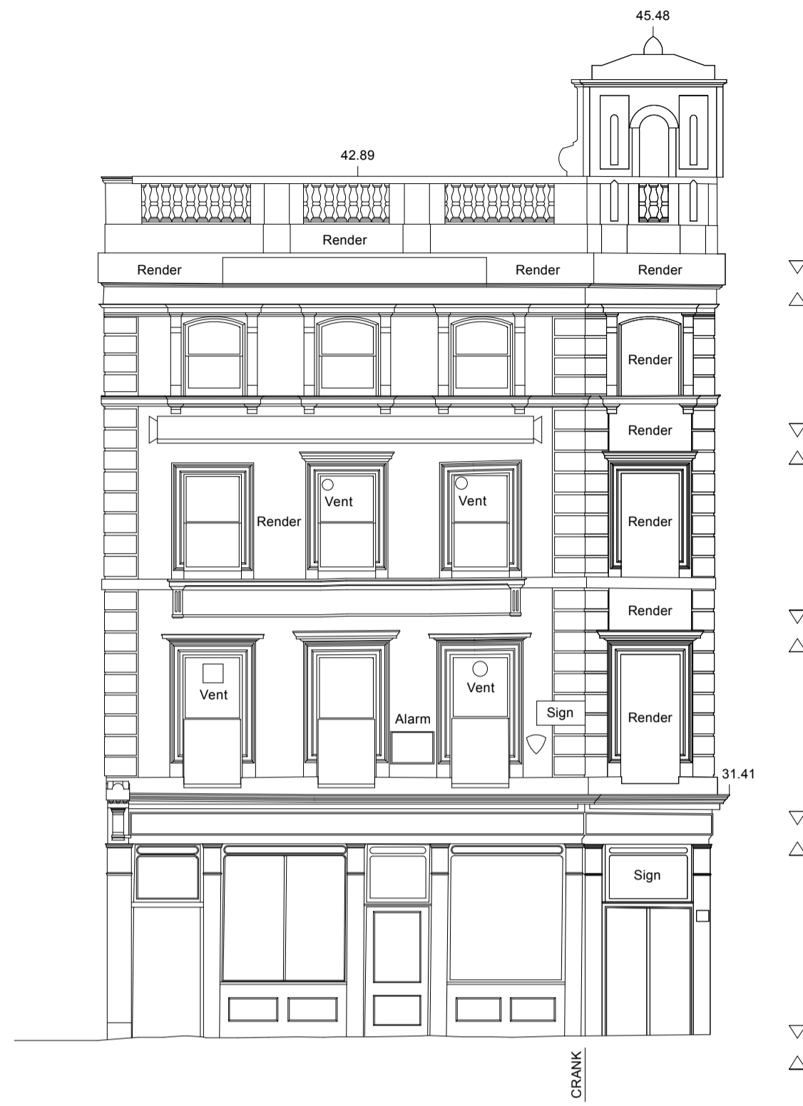
1 North Elevation (Drummond Street) Scale: 1:100