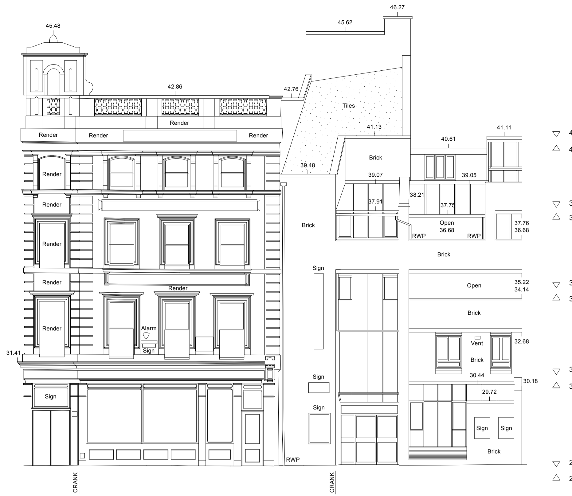
2 West Elevation (Hampstead Road) Scale: 1:100