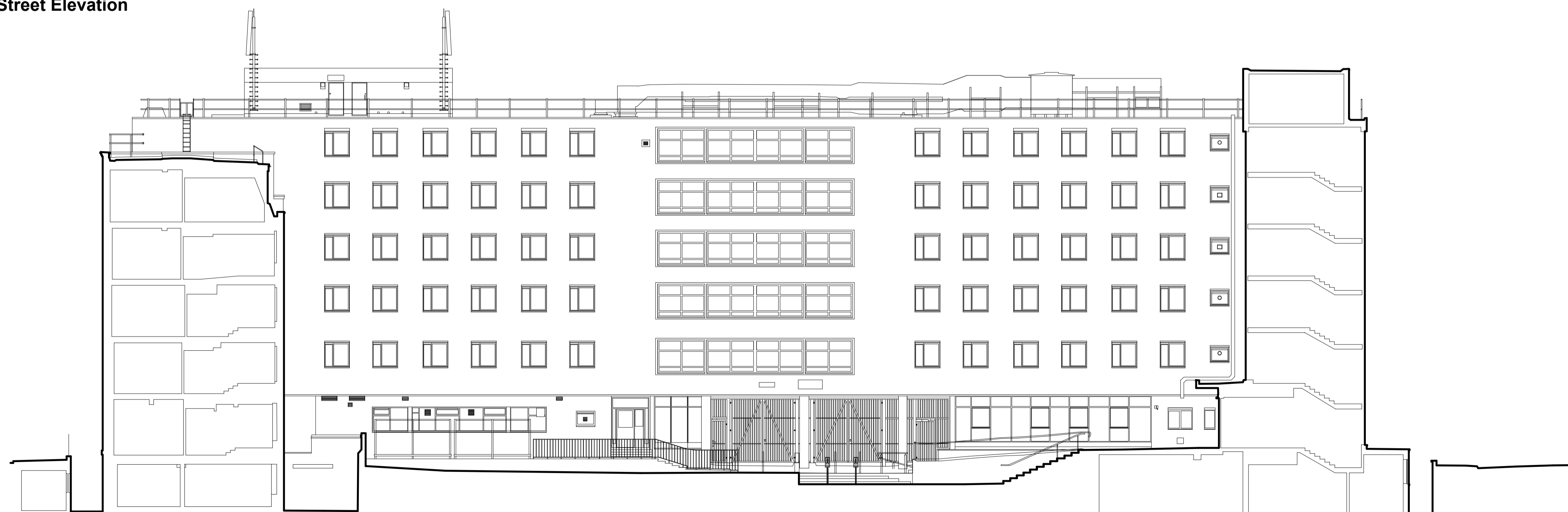
Elevation 05 New York Block - Whitfield Street Elevation

← ROME BLOCK → INTERNAL COURTYARD (New York Block) ← PARIS BLOCK → → MAPLE STREET →