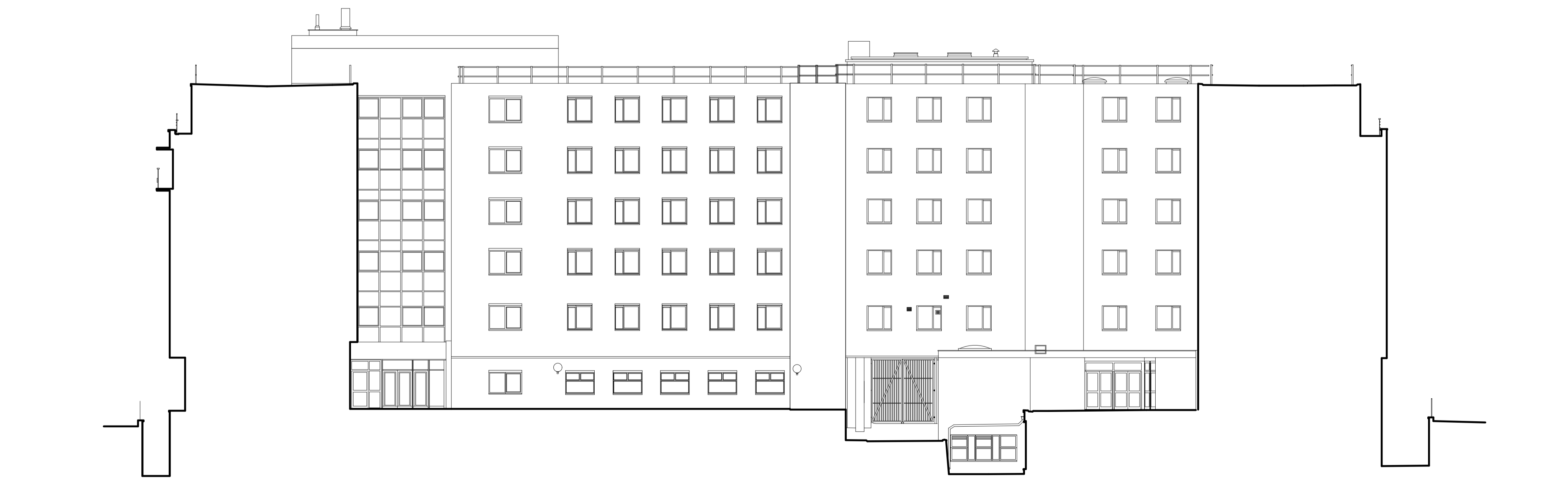
Elevation 08 Paris/London Blocks - Maple Street Elevation

← WHITFIELD STREET NEW YORK BLOCK INTERNAL COURTYARD (Paris block) INTERNAL COURTYARD (London block) LONDON BLOCK FITZROY STREET →