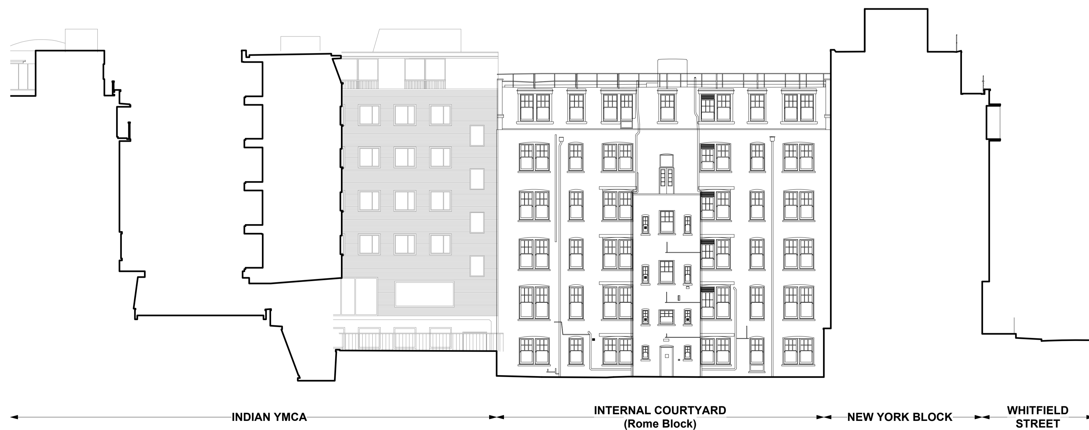
Elevation 07 Rome Block - Courtyard Street Elevation

Drawing No. & Revision 1438-DWG-PL-023-A