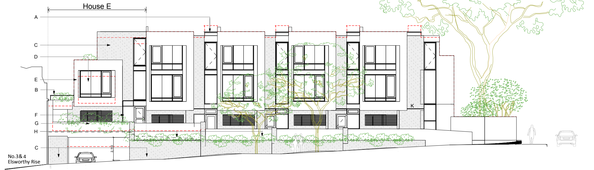
EAST ELEVATION (FRONT) ELSWORTHY RISE 1 : 200