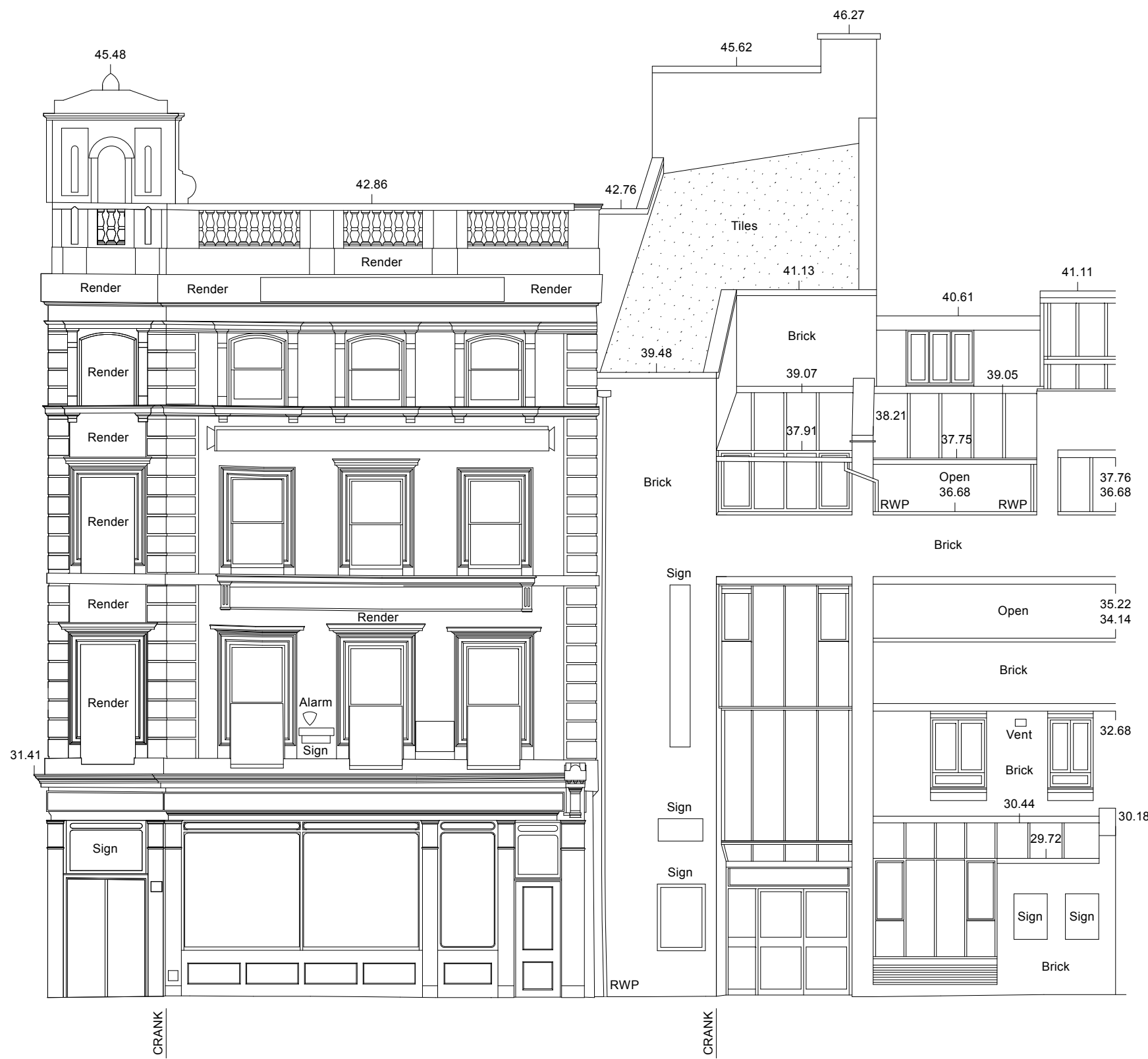
2 West Elevation (Hampstead Road) Scale: 1:100