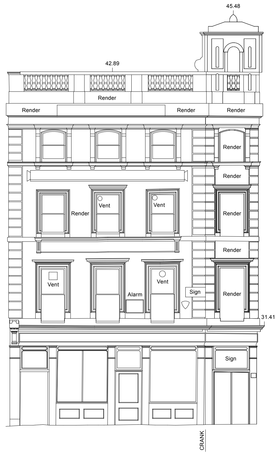
1 North Elevation (Drummond Street) Scale: 1:100