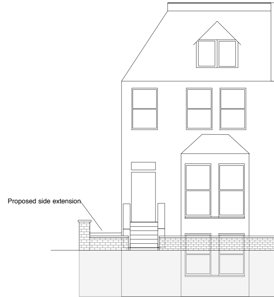
19 Proposed Front Elevation Scale: 1:100