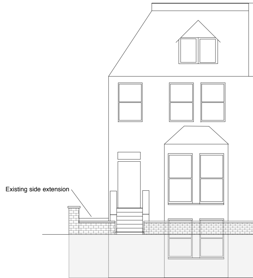
19 Existing Front Elevation Scale: 1:100