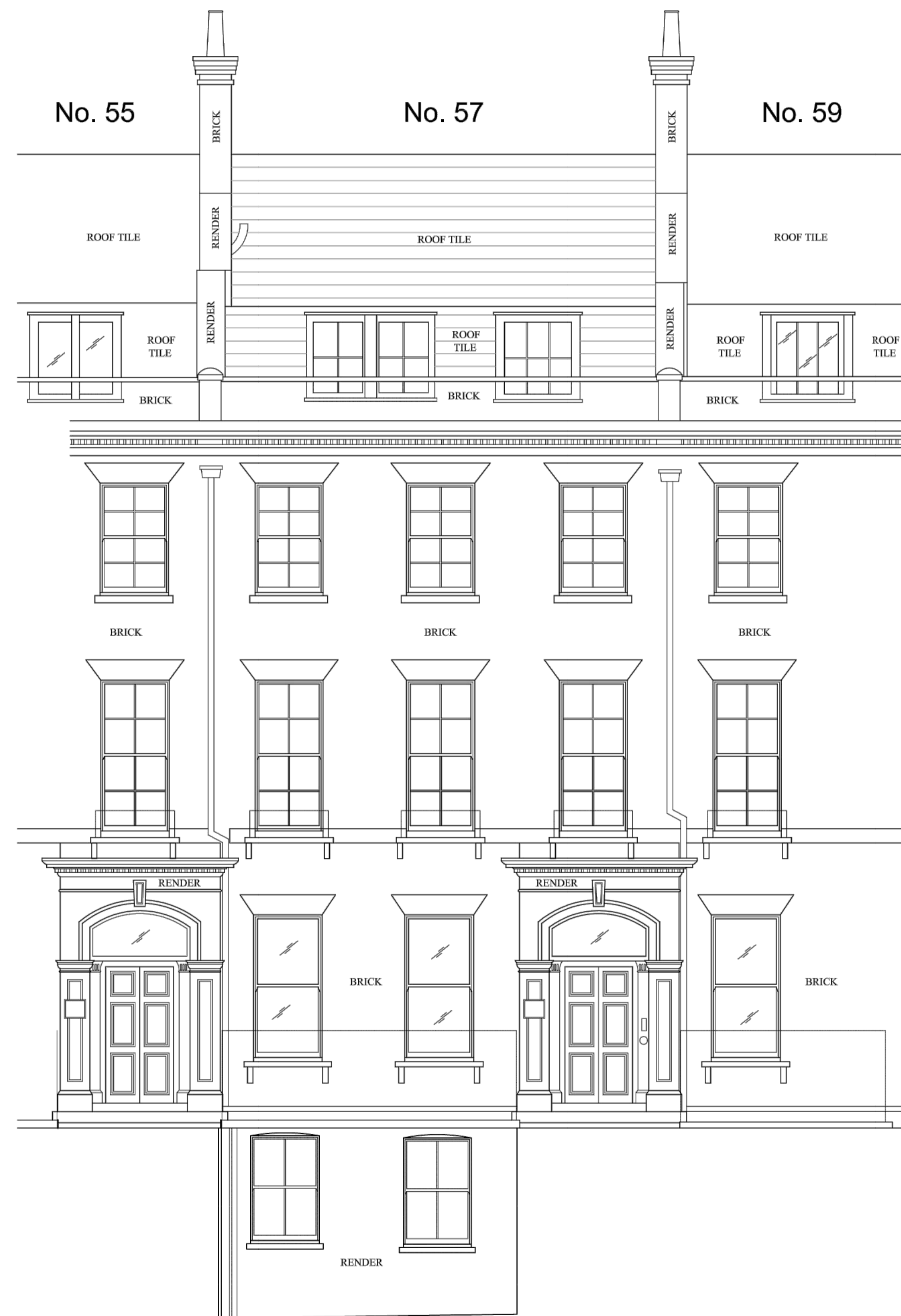
Front Elevation SCALE 1:50