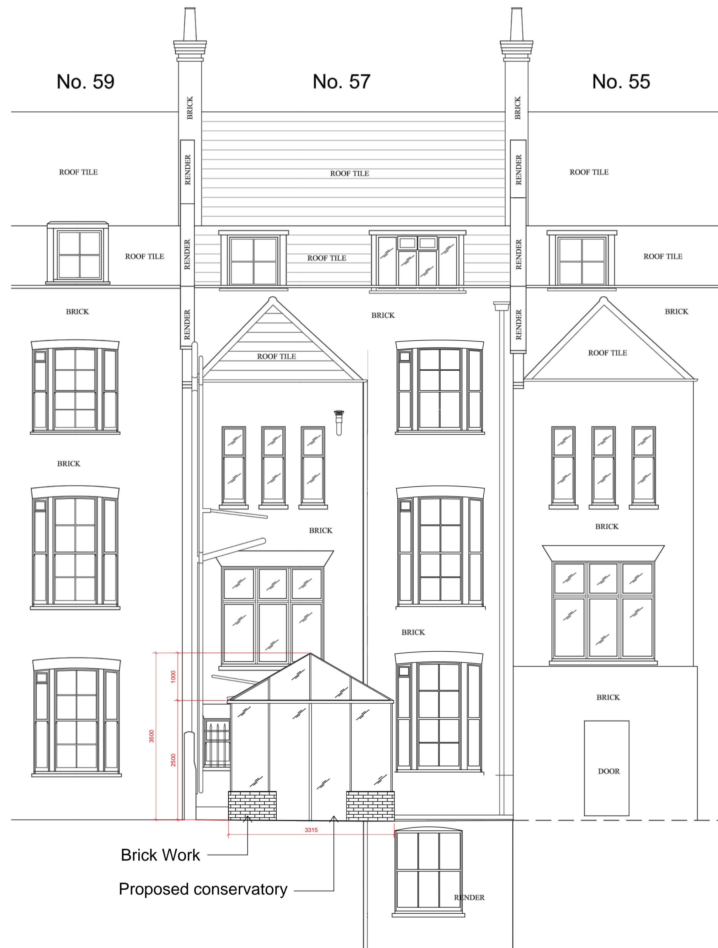
Rear Elevation SCALE 1:50