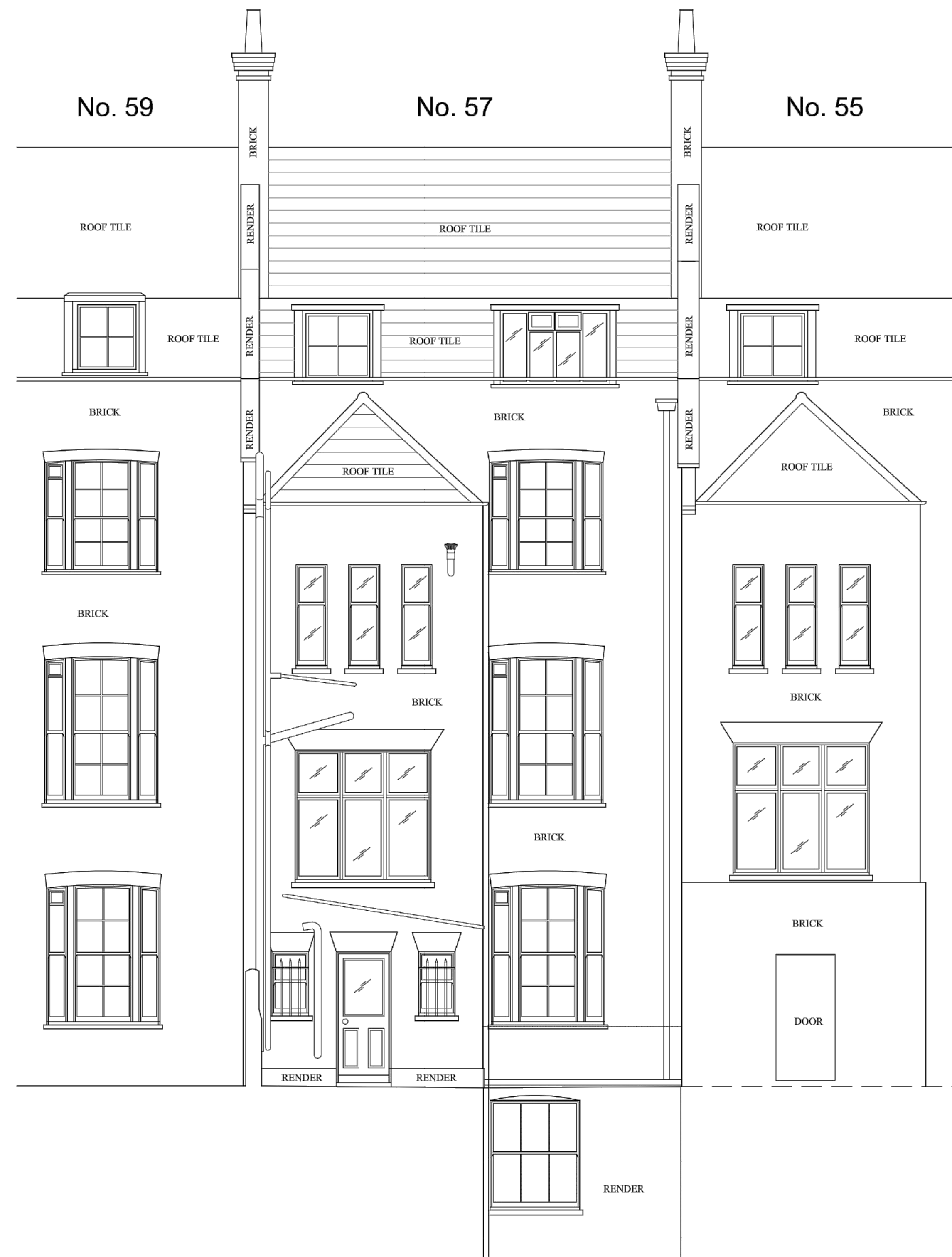
Rear Elevation SCALE 1:50