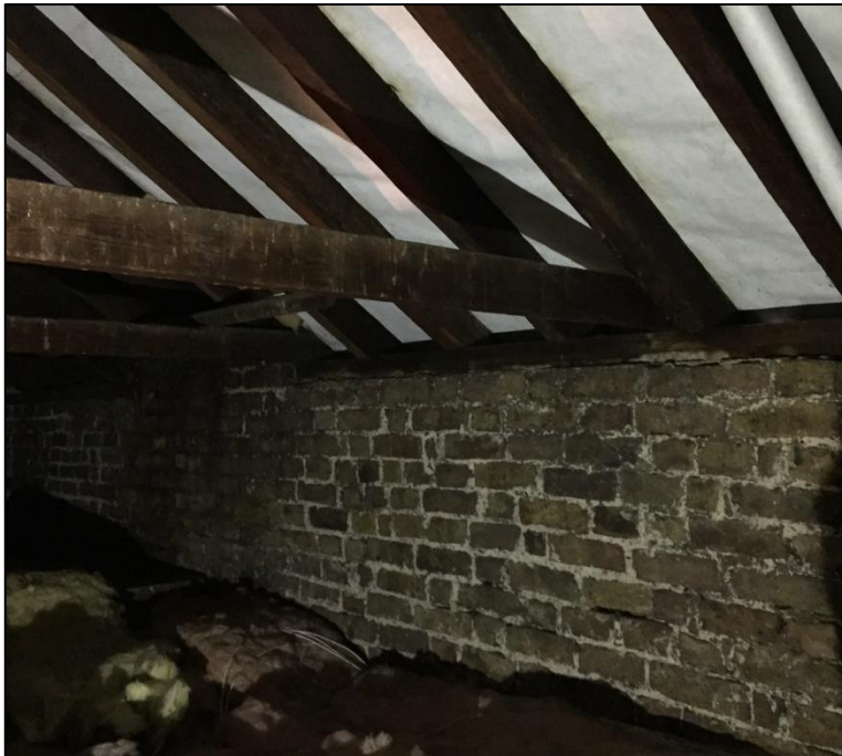
Photo App. 6.2 (above): Detail of the interior of the eastern (rear) roof looking towards the rear (east) wall of the building where it steps in.