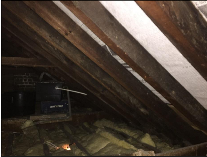
Photo App. 2.5 (above): Detail of the interior of the eastern (rear) roof.