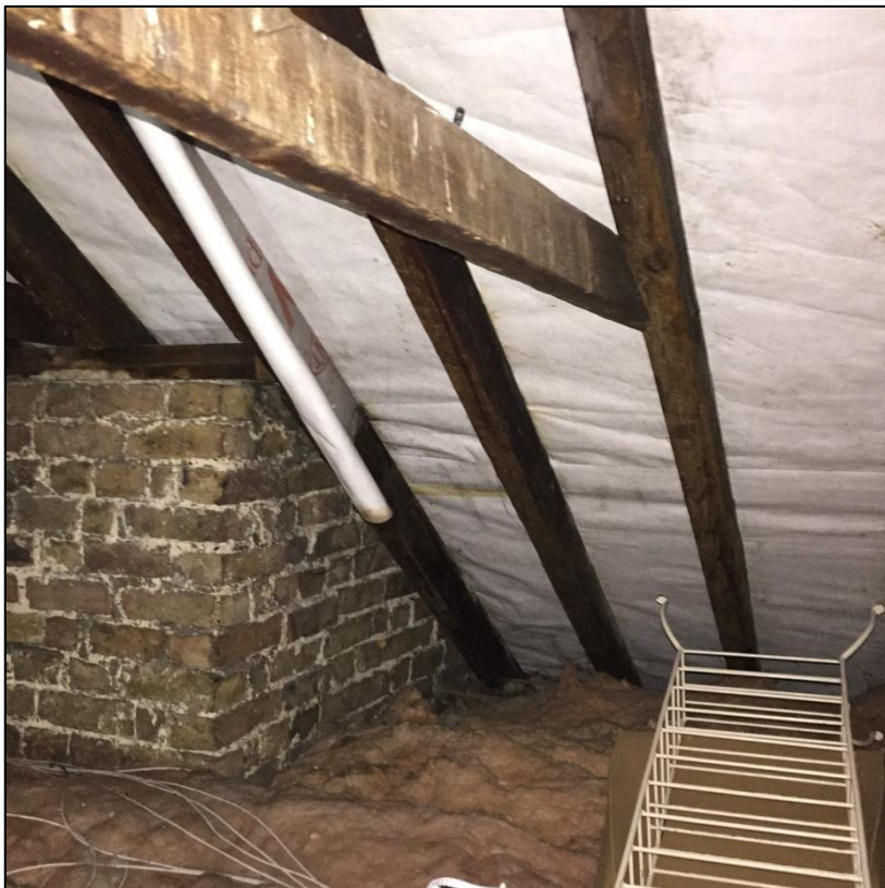
Photo App. 6.6 (above): Interior of eastern (rear) roof at junction of part of the rear wall where the roof extends further to the rear with modern waterproof membrane over the timbers of the roof. Confirming much of the 'exterior' fabric is late 20 th Century alteration/roof replacement.