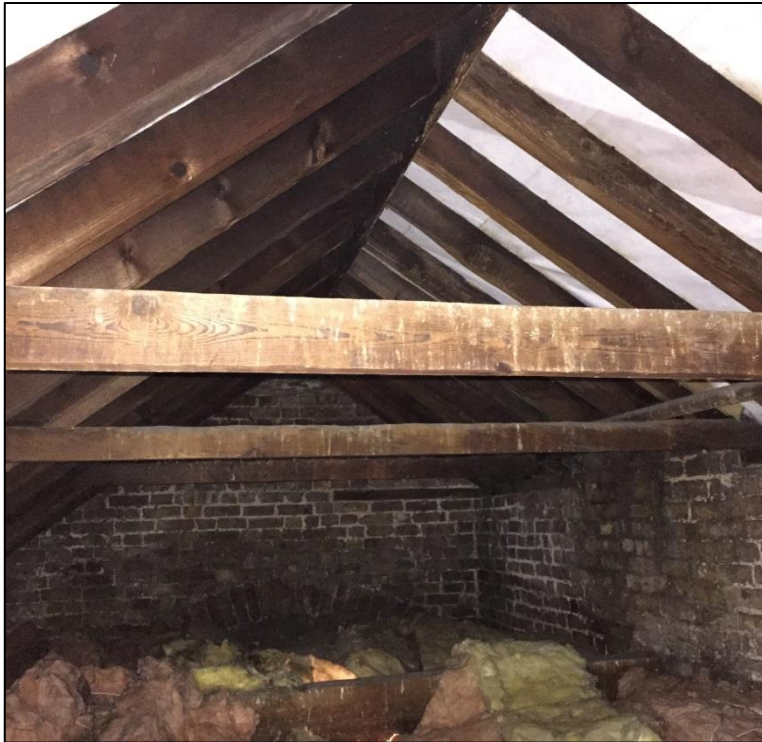
Photo App. 6.1 (above): Detail of the interior of the eastern (rear) roof looking towards the north wall of the building.