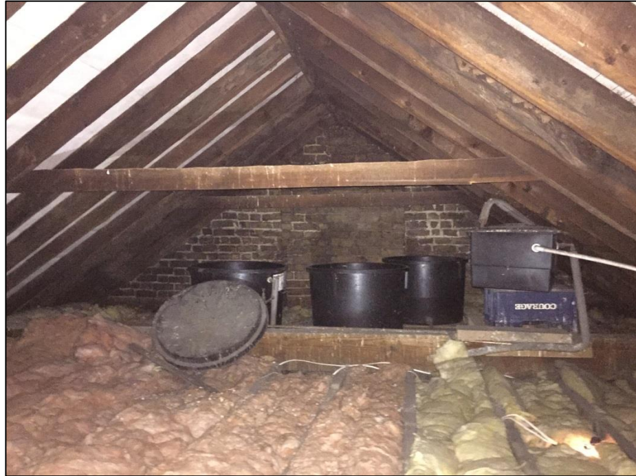
Photo App. 6.3 (above): Detail of the eastern (rear) roof looking towards the south of the building. Modern membrane visible over the timbers throughout with water storage tanks to the southern end.