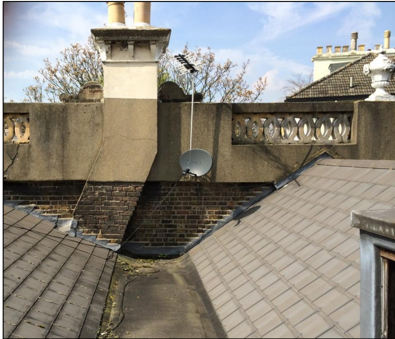
Photo App. 5.1(above): Inside face of north façade with likely non-original roof to front and rendered parapet on the upper section.