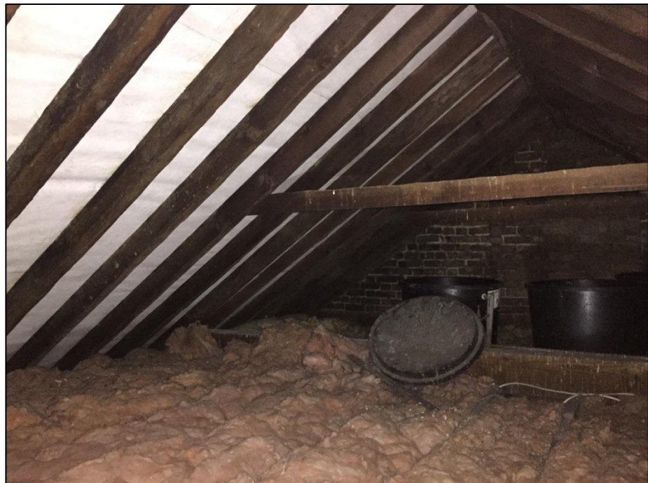
Photo App. 6.4 (above): Detail of the interior of the eastern (rear) roof looking towards the south of the building. Modern membrane visible over the timbers throughout.