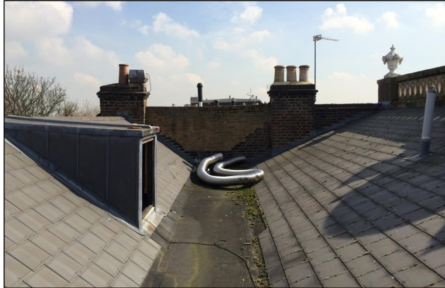
Photo App. 5.5 (above): View towards inside face of south façade and central asphalt sheeting roof gully showing 'modern' new build-up of the party wall with the adjacent property. This clearly shows cut bricks on a different angle to the current front roof suggesting an earlier roof has been replaced with the single slope leaning to the front parapet. The front roof form and fabric is therefore very unlikely to be original.