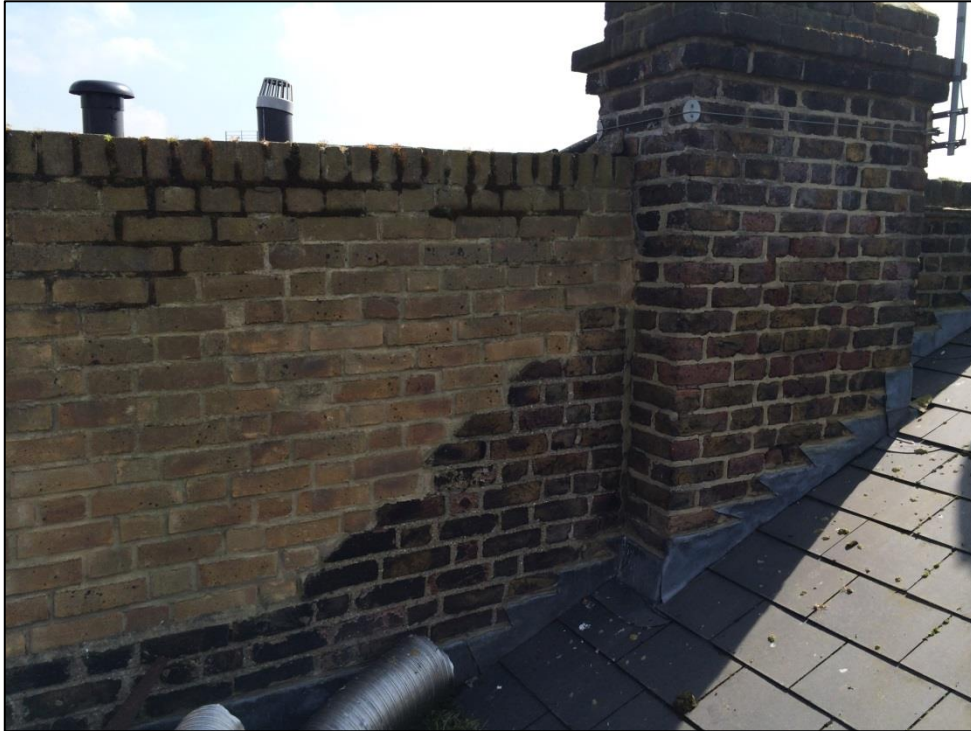
Photo App. 5.7 (above): Detail of the view towards inside face of south façade showing ‘modern’ new build-up of the party wall with the adjacent property and the cut bricks on a different angle to the current front roof suggesting an earlier roof has been replaced with the single slope of the front parapet.