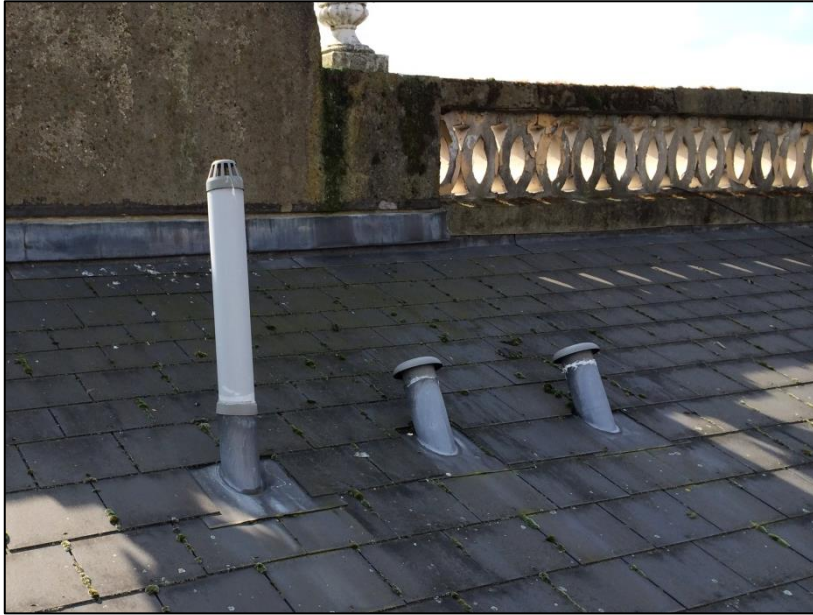
Photo App. 5.3 (above): Inside face of west façade of building roof area with likely non-original roof with ‘modern’ ventilation integral to the roof and the concrete inside facing/alterations to parapet.