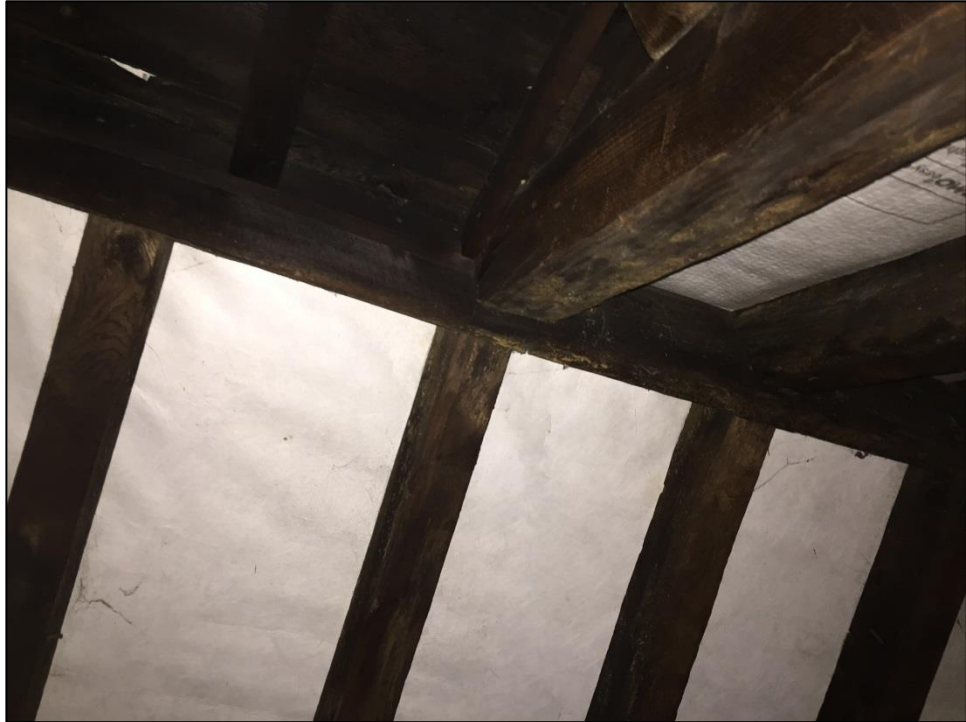
Photo App. 6.7 (above): Detail of modern waterproof membrane over the timbers of the eastern rear roof. Likely late 20 th Century recovering of the roof.