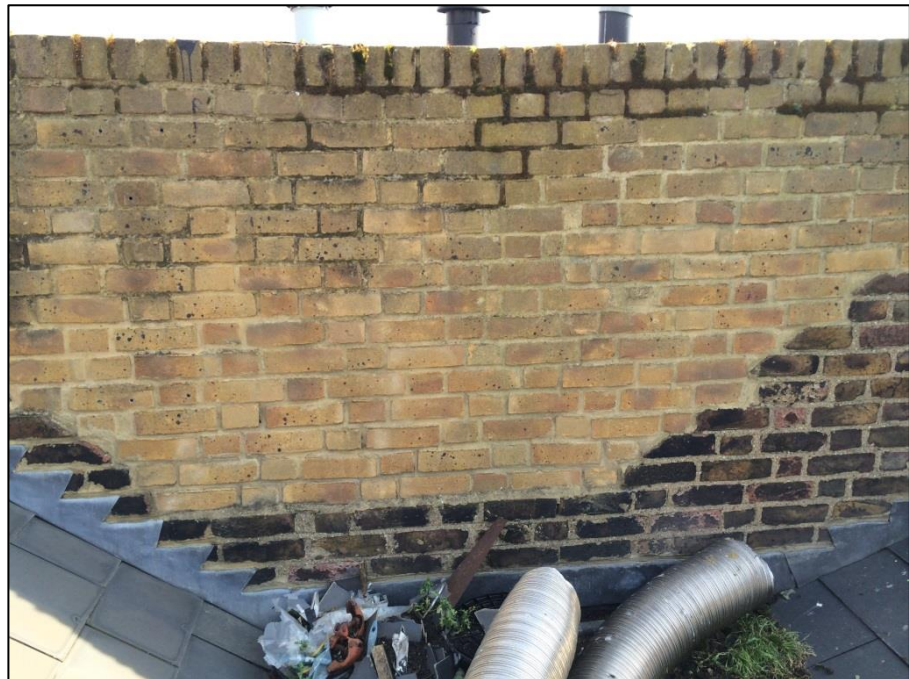
Photo App. 5.6 (above): Detail of the view towards inside face of south façade showing 'modern' new build-up of the party wall with the adjacent property.