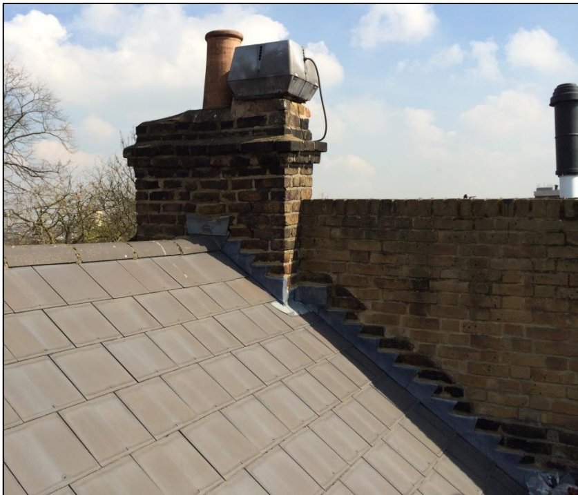
Photo App. 5.8 (above): Detail of the view towards inside face of south façade showing ‘modern’ new build-up of the party wall adjacent to the eastern (back) roof where the roof form/pitch may be original but all of the external roof fabric is later replacement likely from the mid to late 20 th Century.