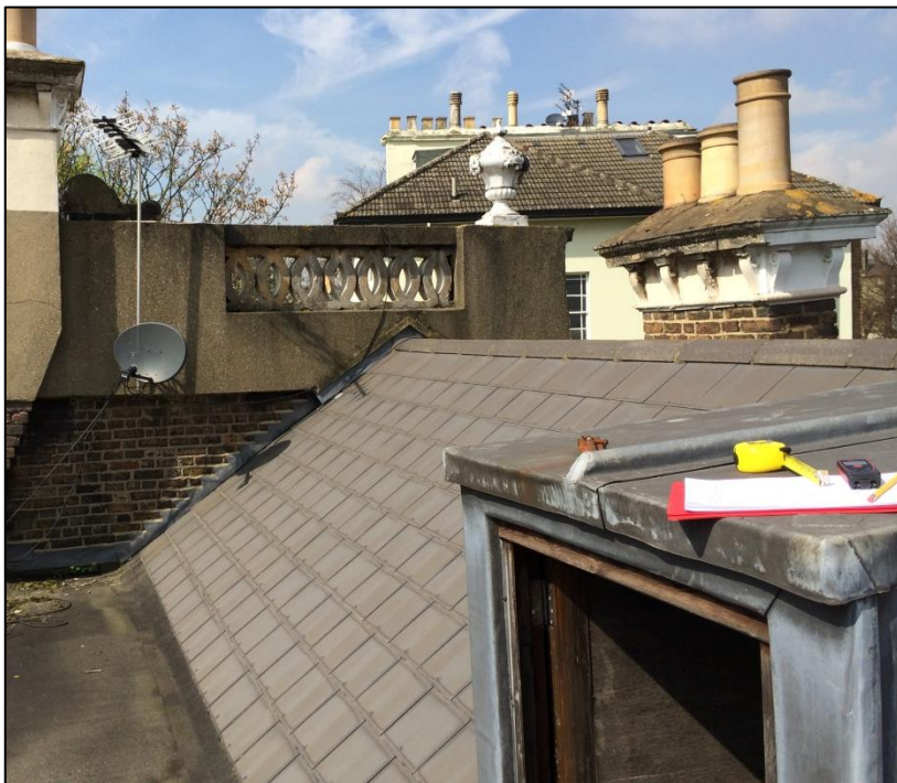
Photo App. 5.4 (above): Inside face of north façade and east portion of roof area with access hatch from roof space. Roof form may be ‘original’ but has been recovered with artificial slates and modern underlay. Also shows rendered facing/alterations to parapet.