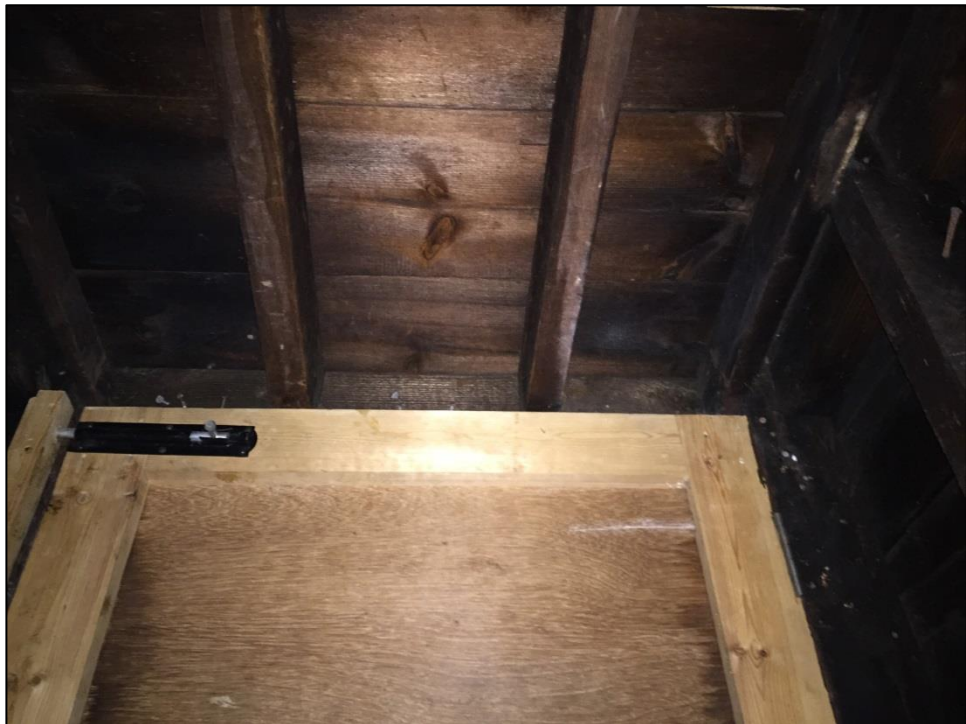
Photo App. 6.8 (above): Detail of interior of roof space access hatch to roof. Door timber is clearly a significantly later addition. This is from the pitched roof to the rear of the building.