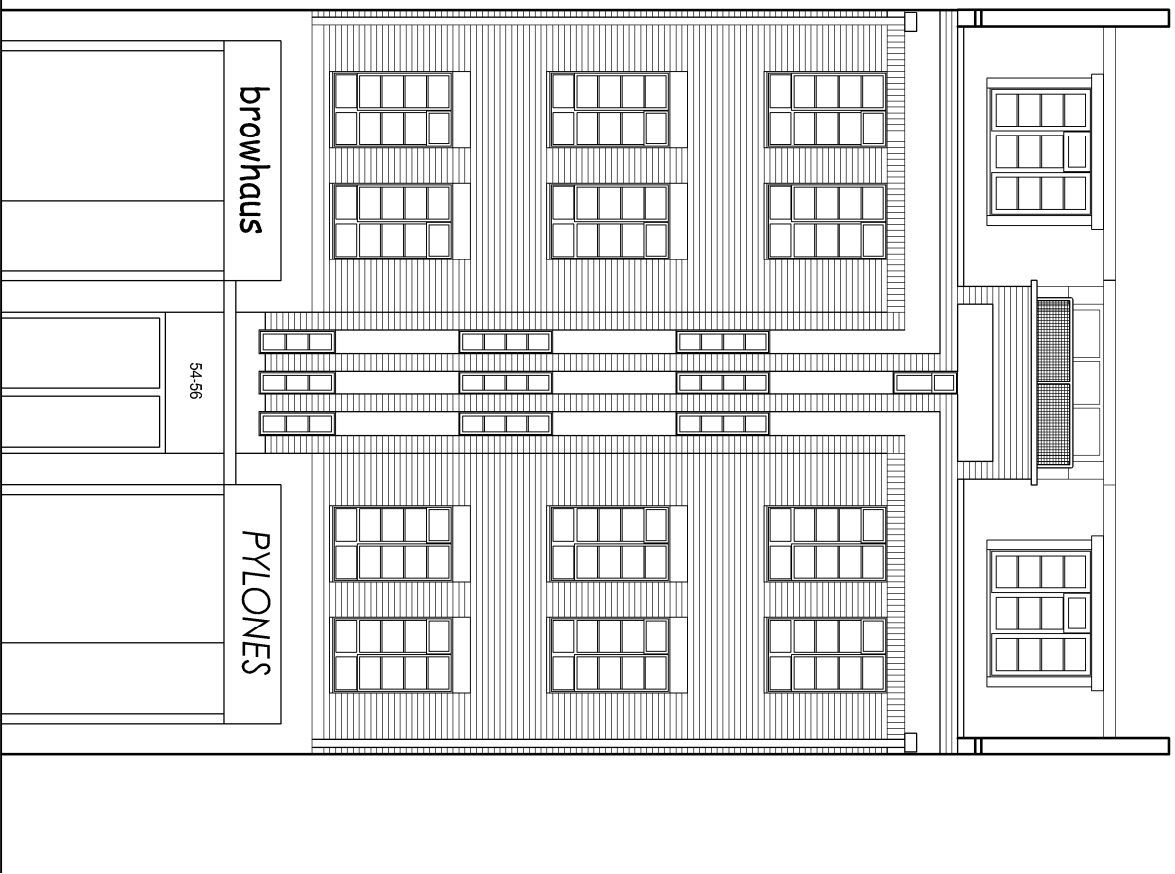
Existing Front Elevation (fronts onto Neal St)