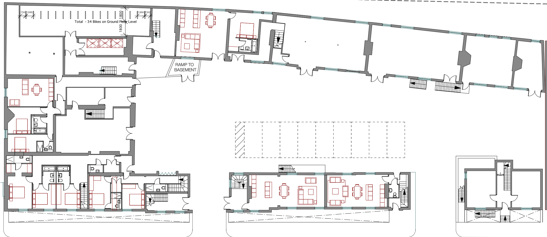
01 Ground Floor Plan - Cycle stores 1:125 @ A1, 1:250 @ A3