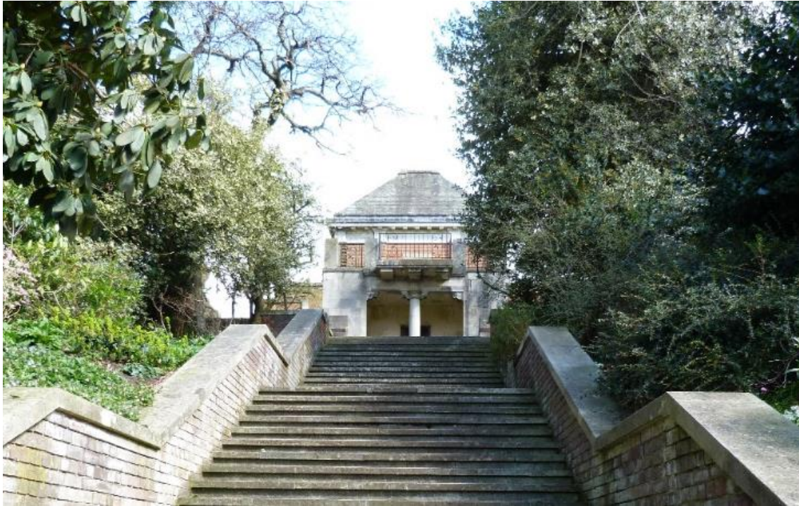
1 – Belvedere Structure