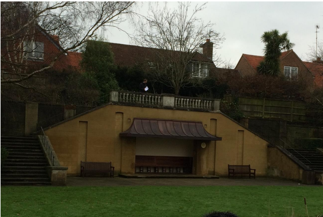
2 – Hill Garden Shelter