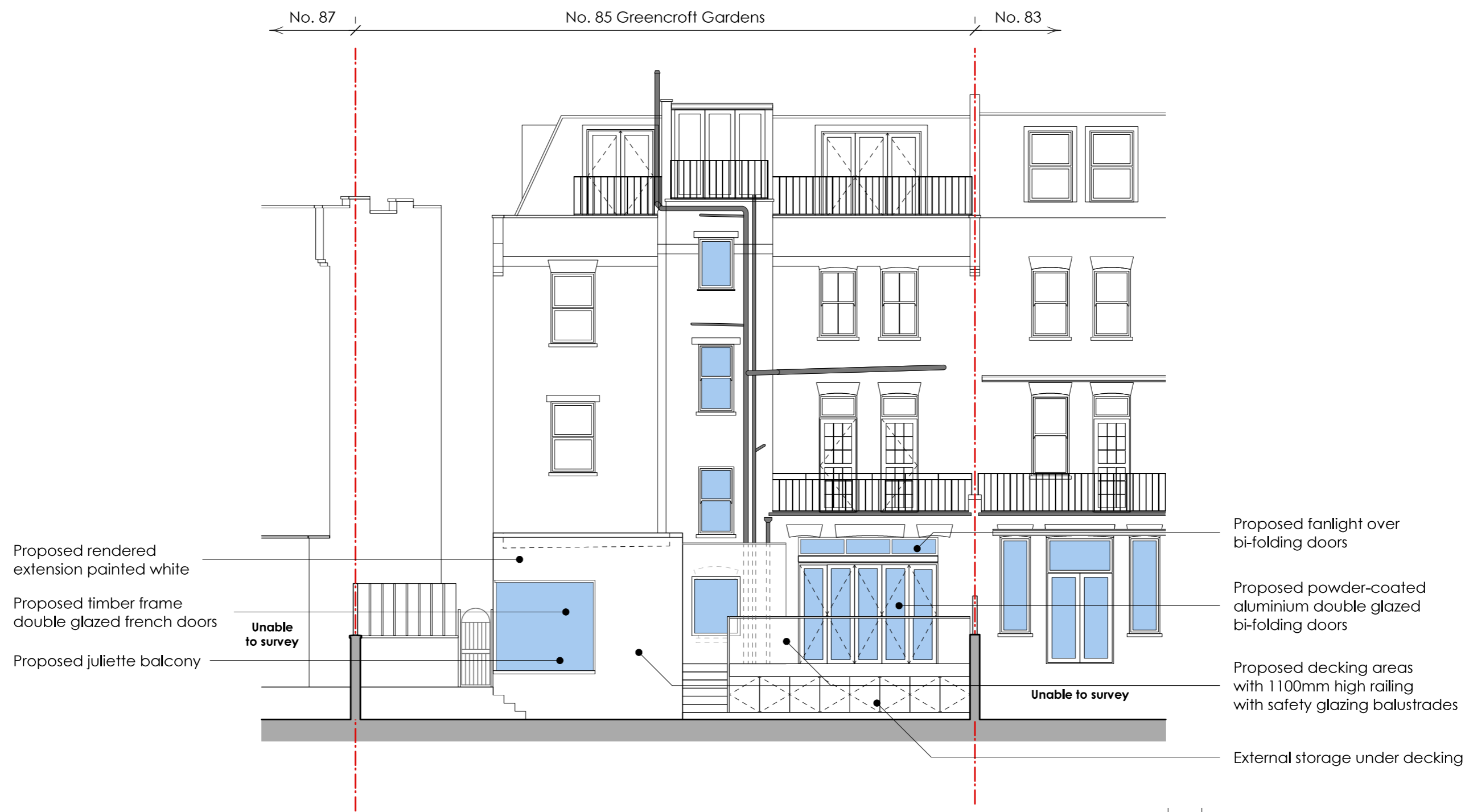
1 P-120 Proposed Rear Elevation scale 1:100 @ A3