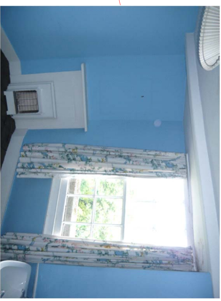
Overhaul and repair sash window. Retain fireplace surround and remove electric heater. Re-instate fireplace and hearth.