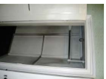
Retain door & architrave to cupd. Remove cupd. wall made of plywood for access to the rear room