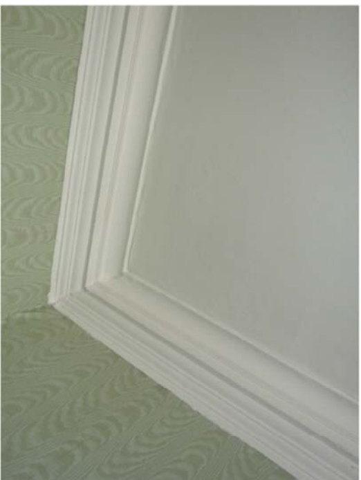
Existing ceiling and cornice to be retained and repaired.