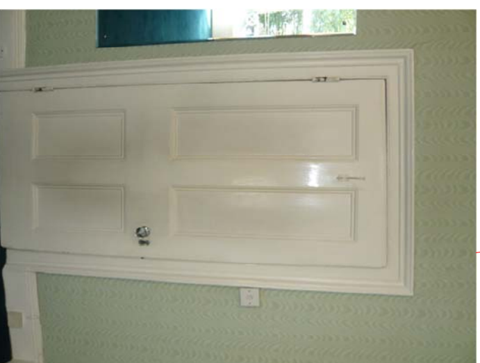
Strip and repaint timber door. Retain skirting and architrave.