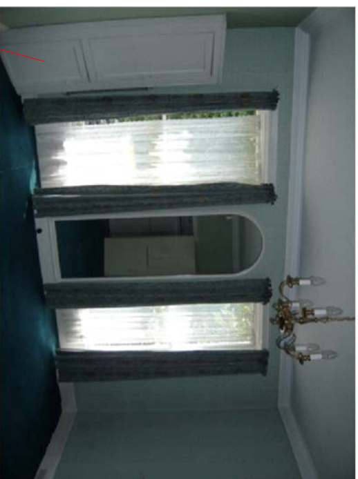
Overhaul and repair sash windows. Retain skirting and floorboards. Overhaul and retain corner cupd.