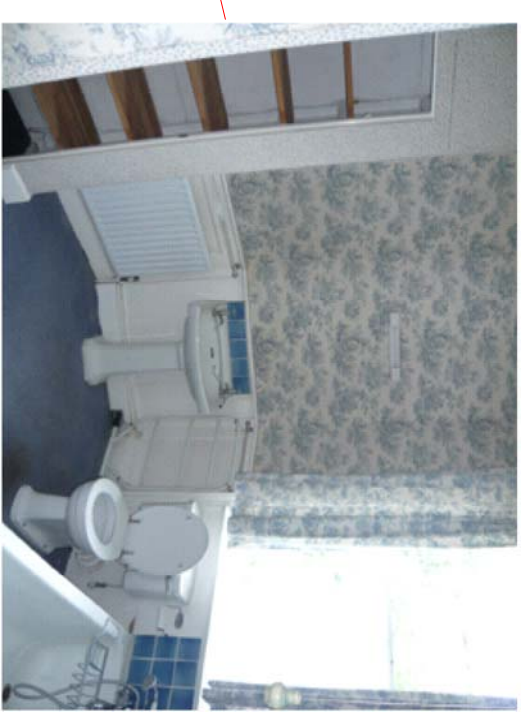
Overhaul and repair sash window. Repair and retain cornice. New bathroom stud wall partition shall have moulded plaster cornice and timber skirting to match the existing.