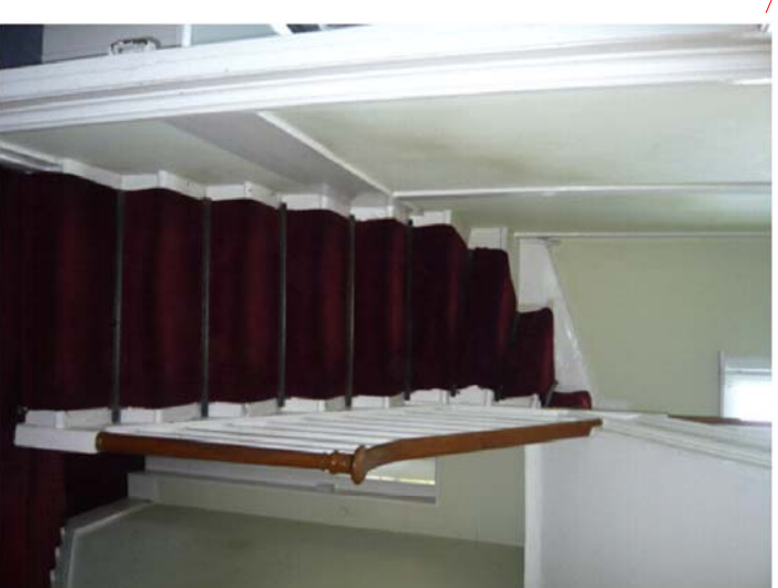
Retain hallway panelling. Retain wooden staircase and balustrade.