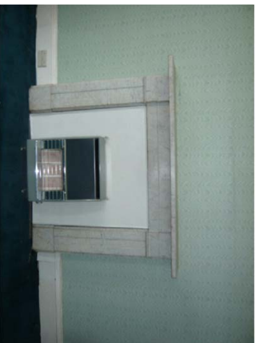
Existing fireplace surround to be retained. The fireplace and hearth to be reinstated.