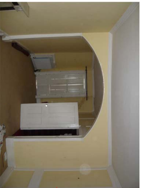
Retain, strip and repair: wooden wall panelling, sash windows and window shutters.