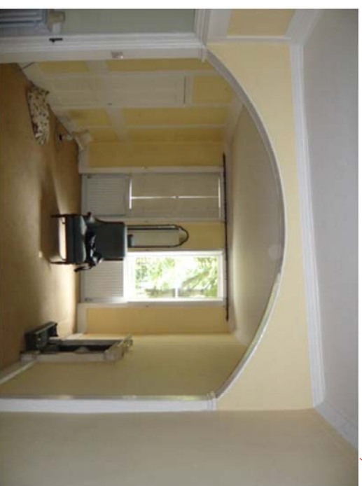
Retain, strip and repair: wooden wall panelling, sash windows and window shutters.