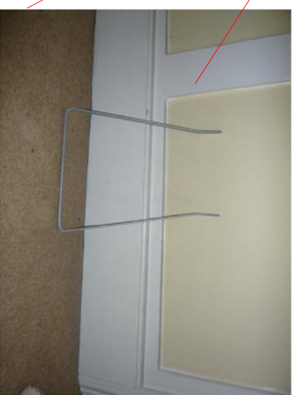
Retain, strip and paint skirting board.