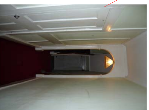
Retain wooden wall panelling and wooden staircase with balustrade.