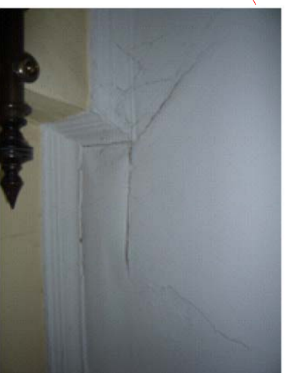
Retain and repair areas of water damaged lath and plaster ceiling and cornice.