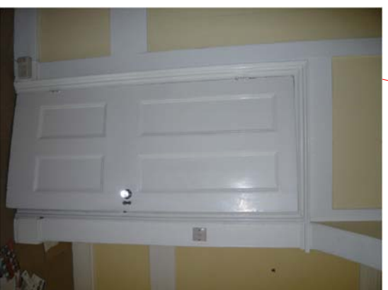
Strip and repaint all timber doors.