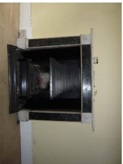
Retain fireplace surround and reinstate hearth.