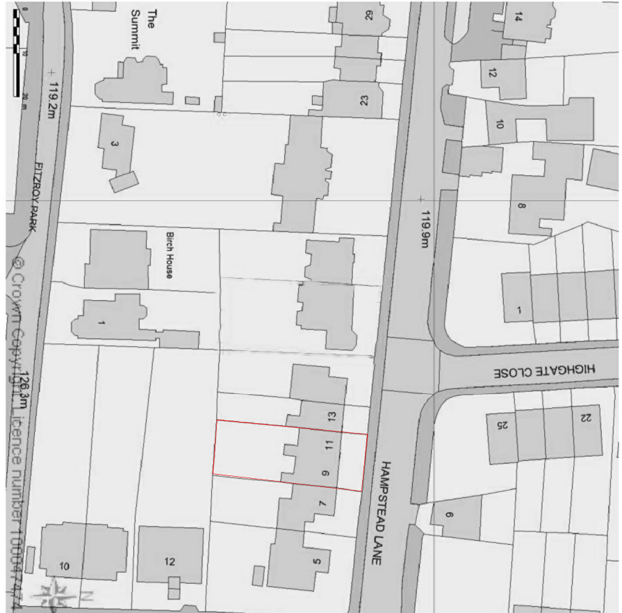
EXISTING LOCATION PLAN SCALE 1:1250@A3 LP-01