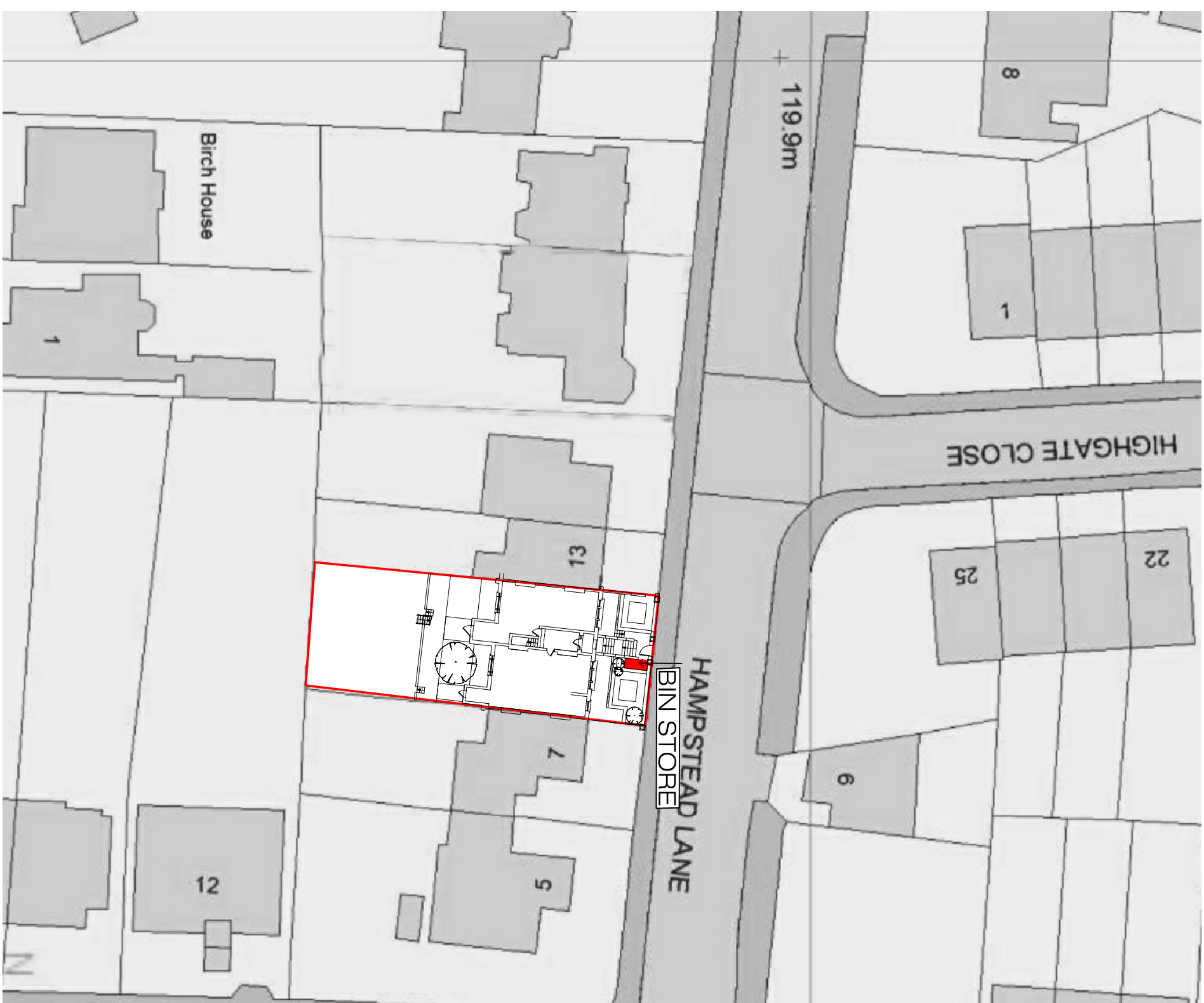
EXISTING SITE PLAN SCALE 1:500@A3 LP-01