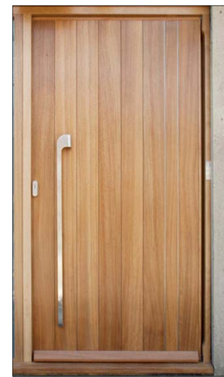
Sample of Front Door