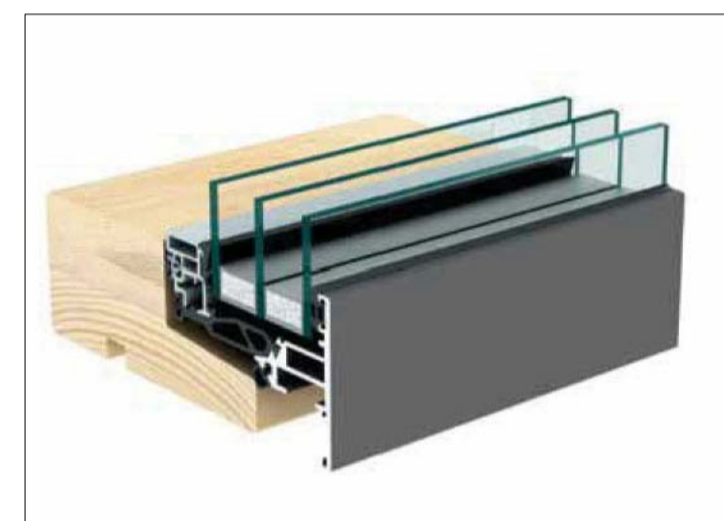
Sample of Window to the front elevation