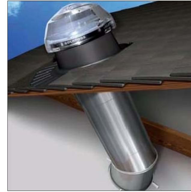
Sample of Sunpipe