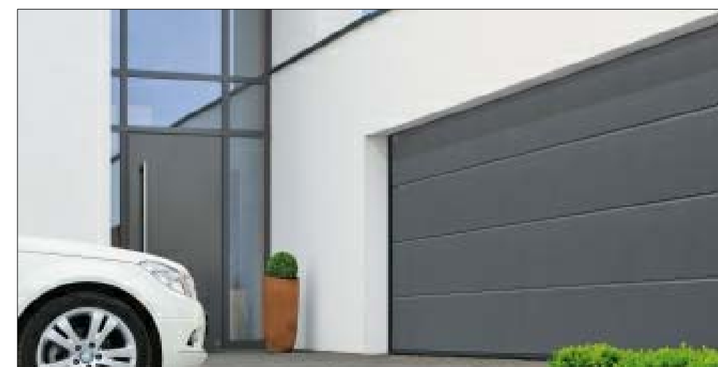
Sample of Garage Door