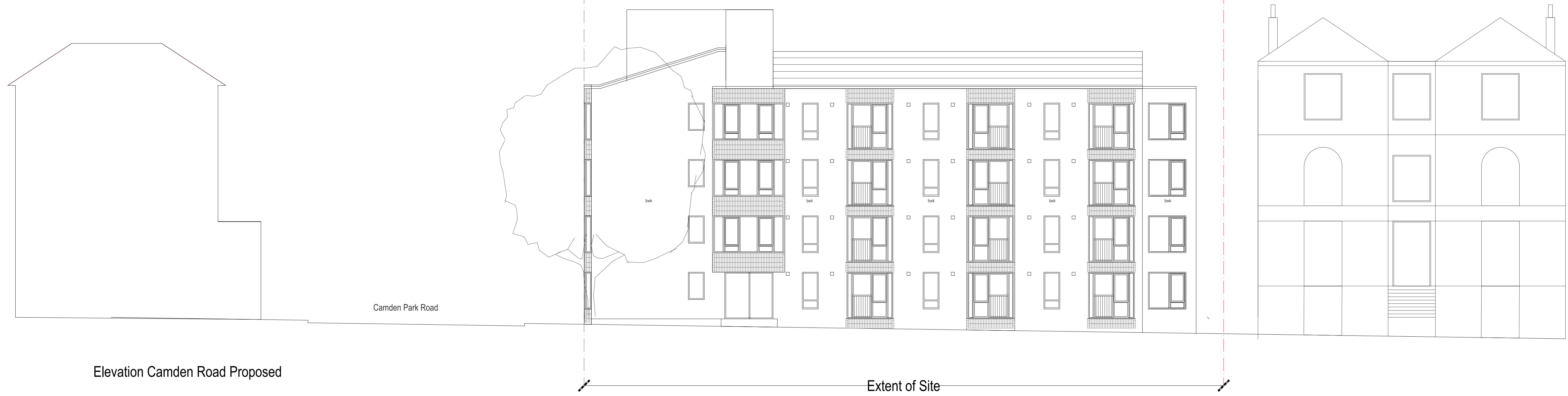
Elevation Camden Road Proposed