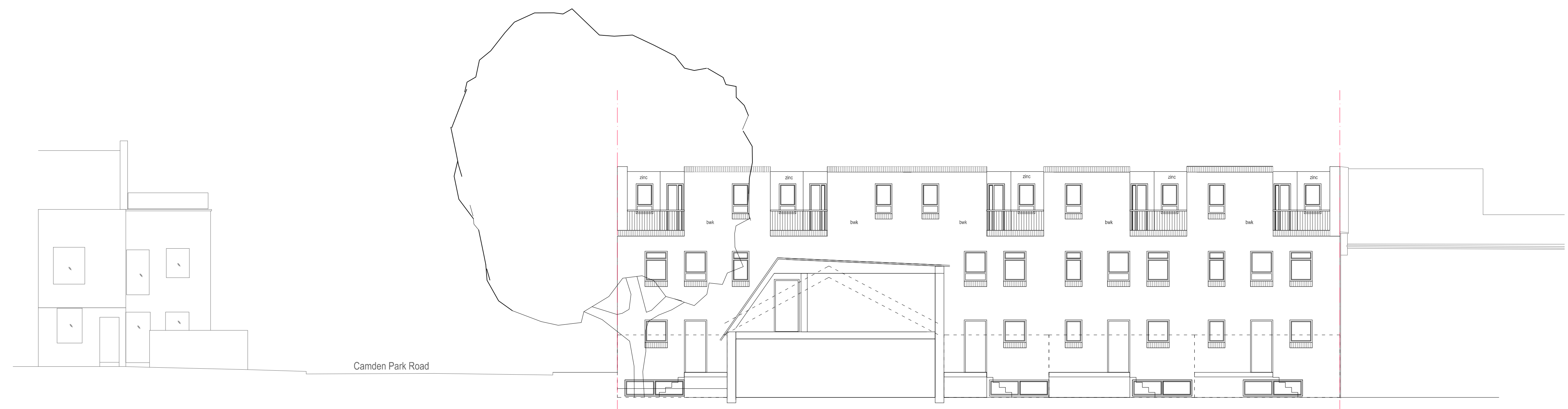
Elevation Camden Mews Rear Proposed