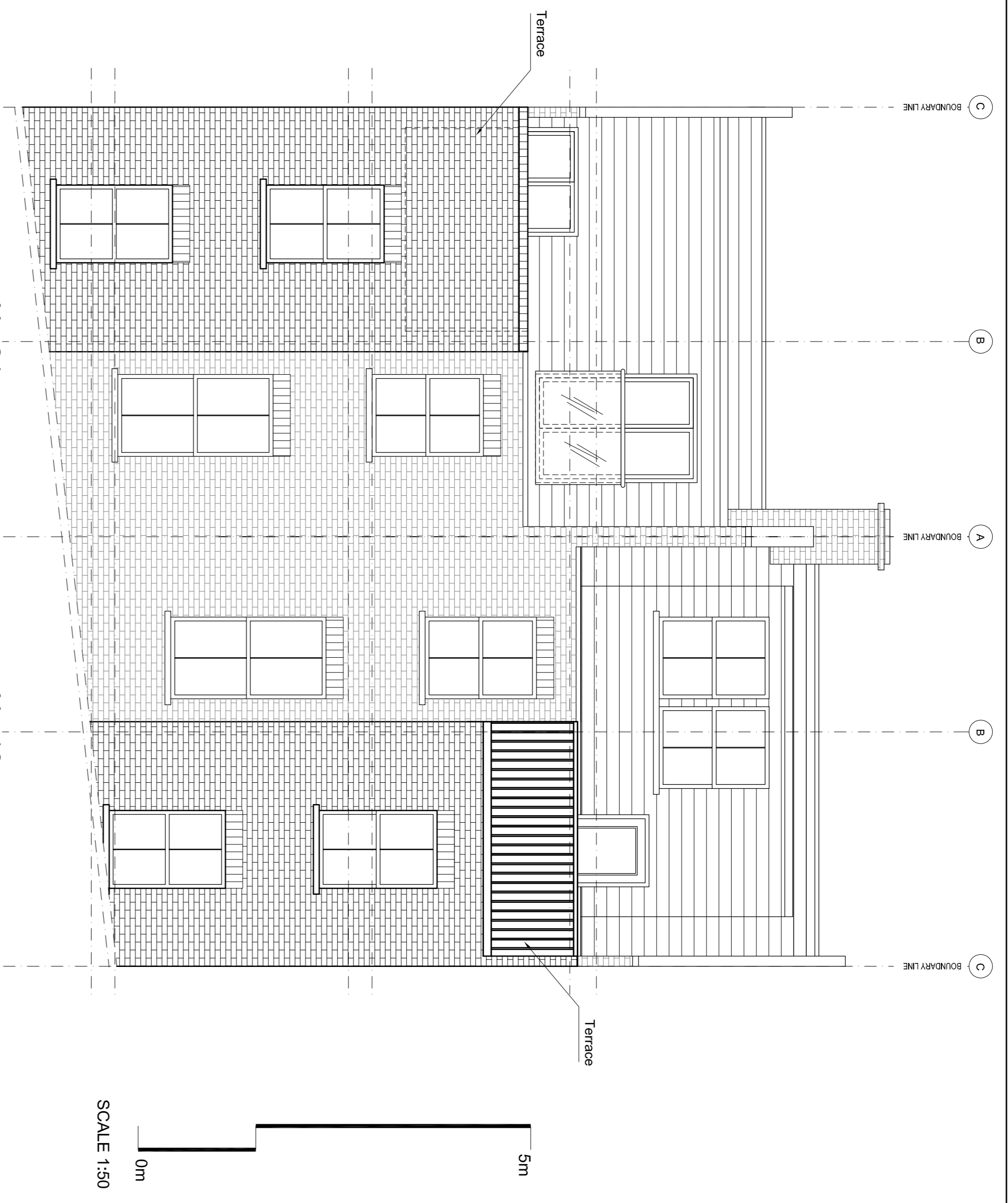
02: PROPOSED REAR ELEVATION No 19-21 SCALE 1:50