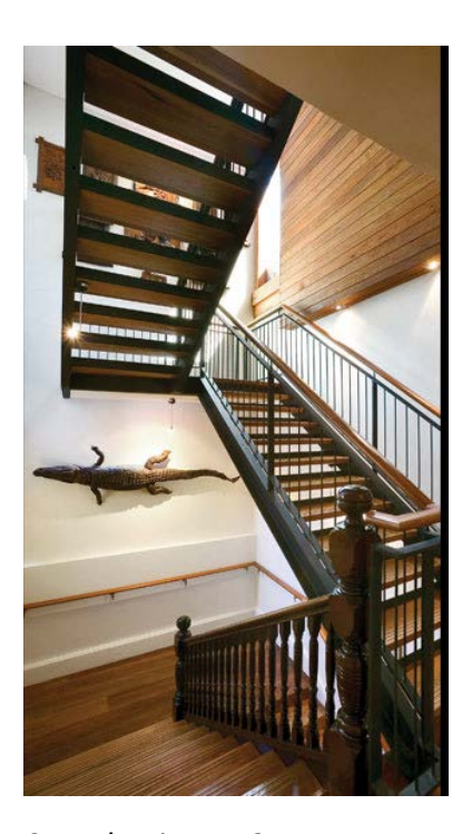
Sample Picture 3.

By creating of the mezzanine this allows them to have an area where they can both work from or be in the same room whilst working and as they have a very large family they cannot use one of the bedroom areas as an office space as they will not have enough accommodation for the family.