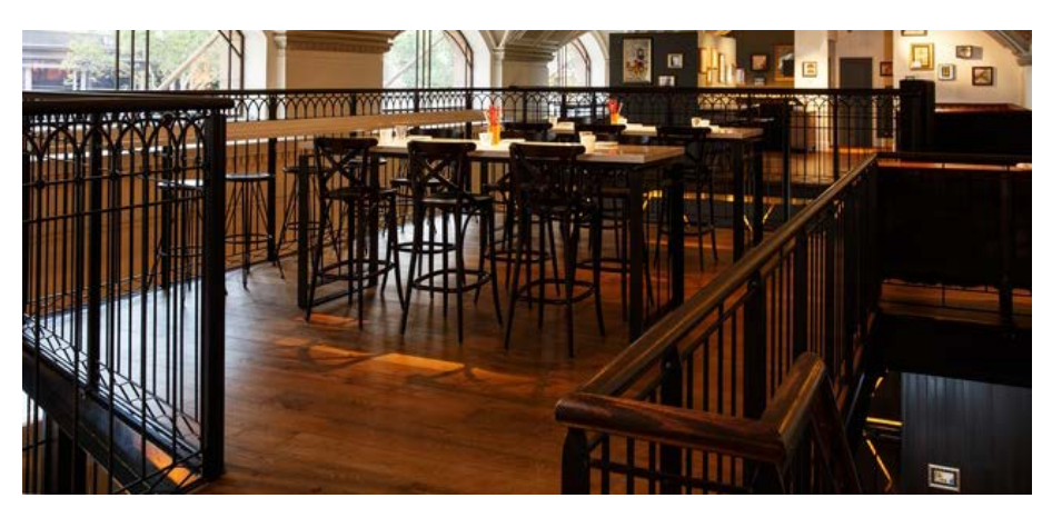
Sample Picture 1.

The construction itself will involve affixing a wall plate to the corner of the room and install timber supports for the mezzanine with railings and timber stair treads