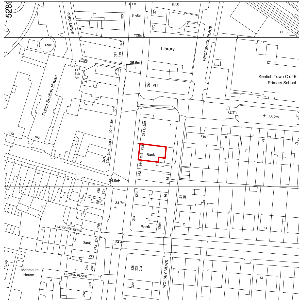
LOCATION PLAN 1:1250 @ A3