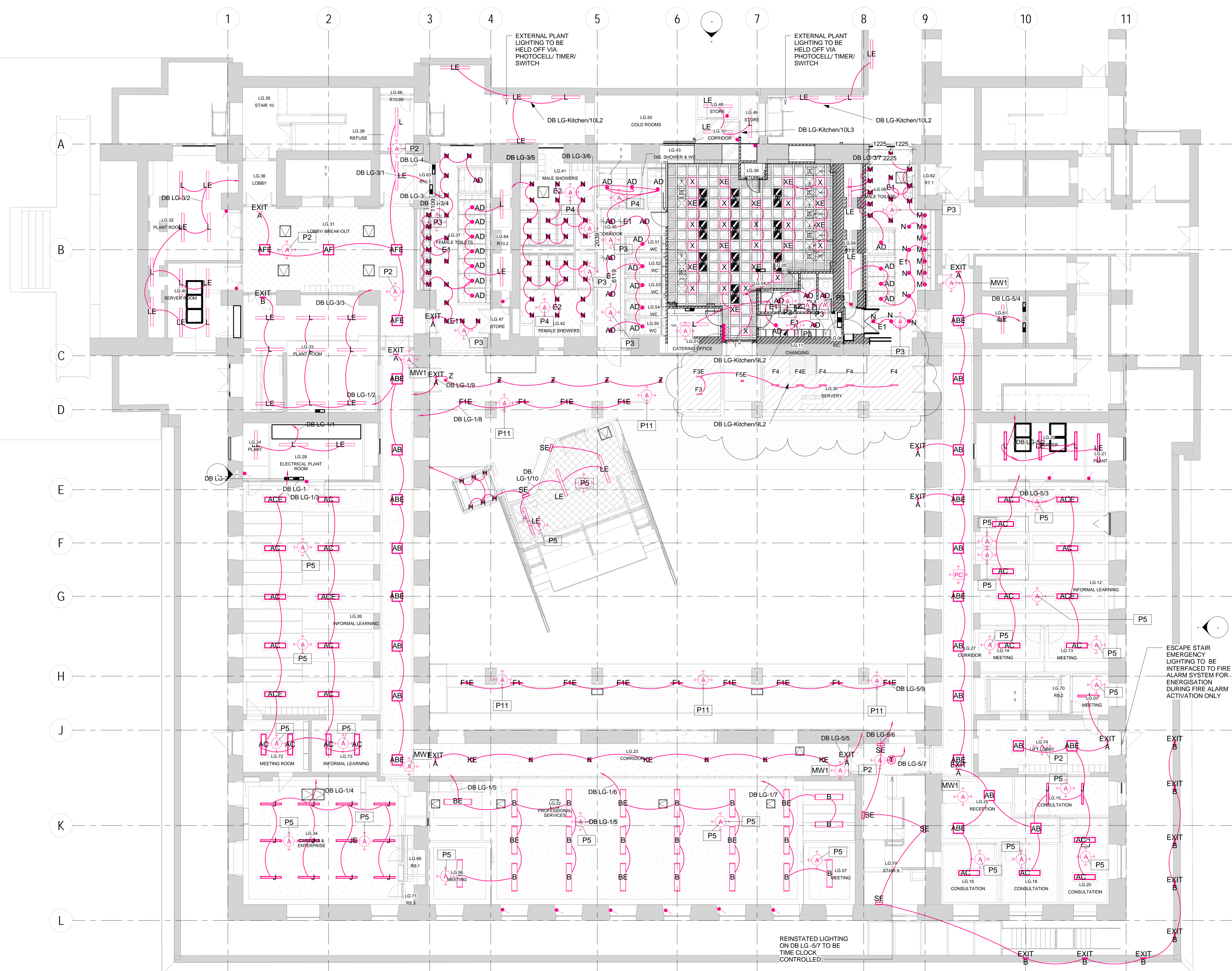
01 Lower Ground - Lighting 1 : 100

INFORMATION HANDLING CLASSIFICATION: UNRESTRICTED