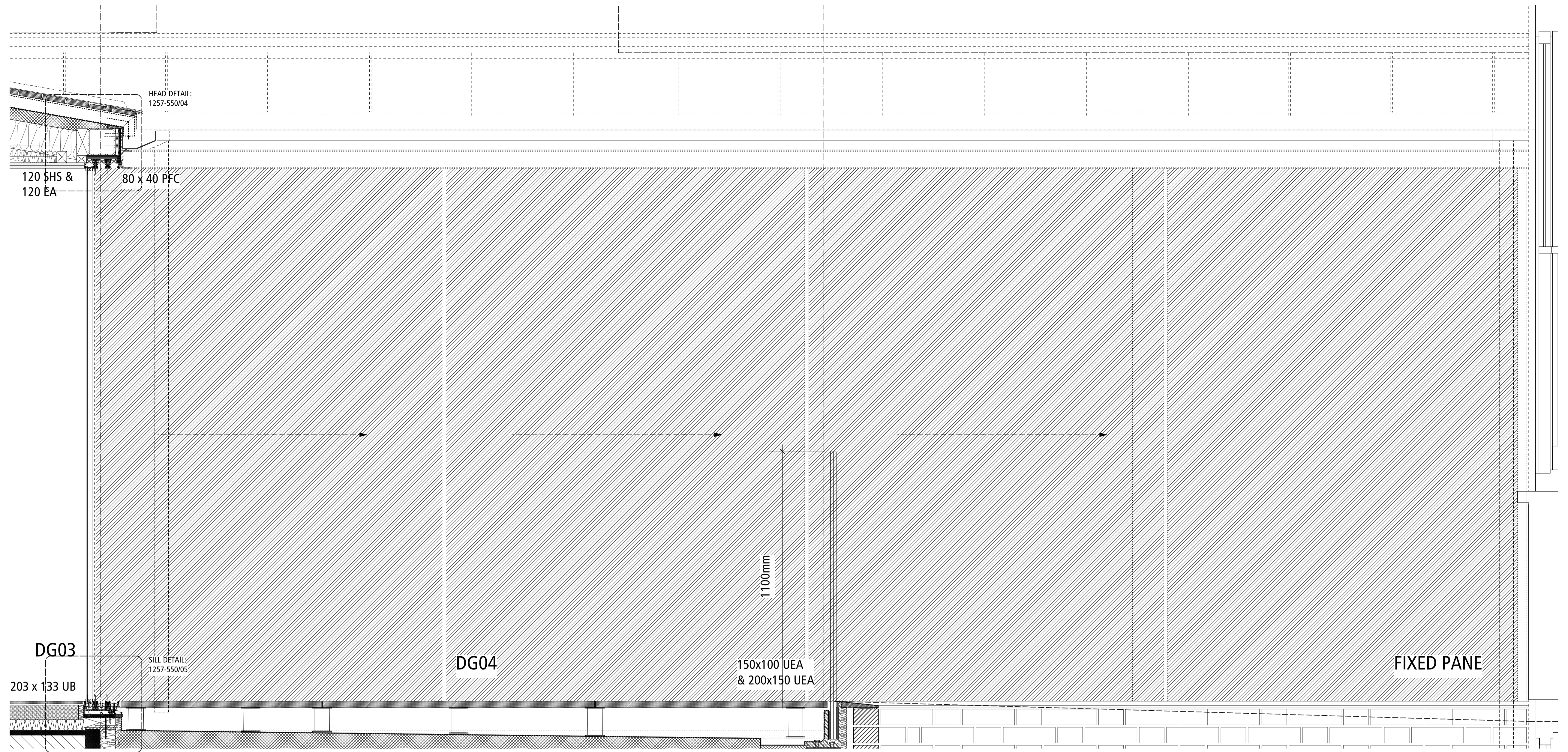
PROPOSED ELEVATION OF DG.04 @ 1:10